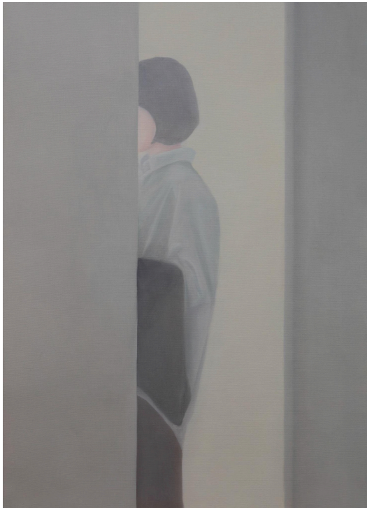
Han Ji Min Egress , 2025 Oil on canvas 35 3/4 x 25 5/8 in 90.9 x 65.1 cm