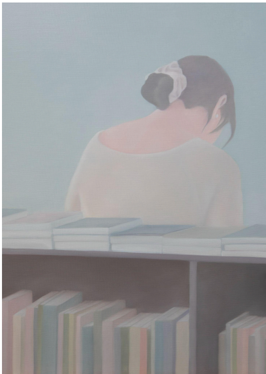
Han Ji Min Reader , 2025 Oil on canvas 35 3/4 x 25 5/8 in 90.9 x 65.1 cm