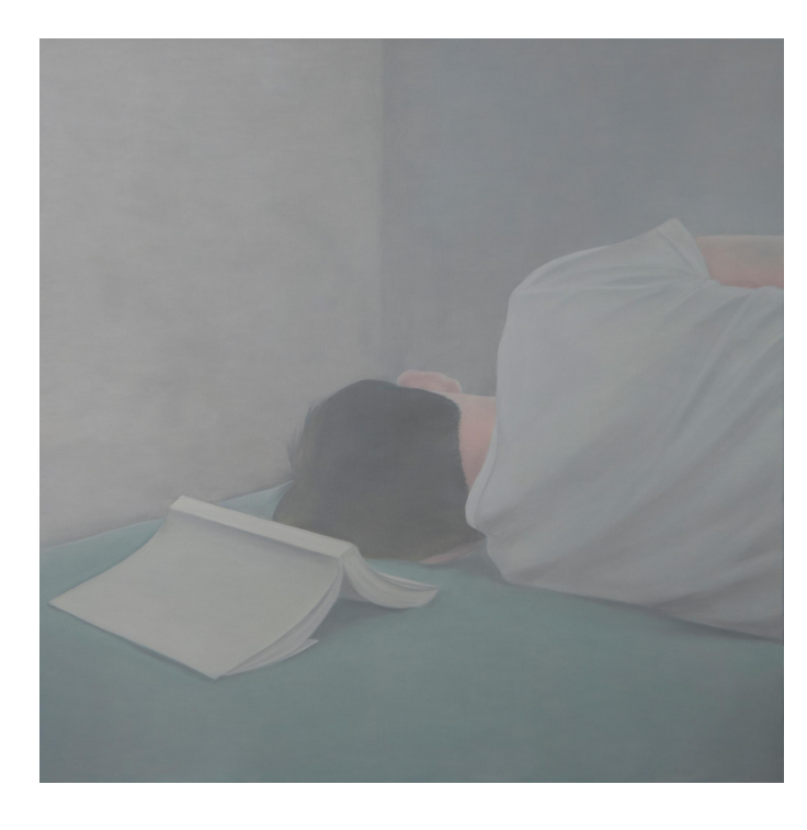
Han Ji Min Shoulder , 2023 Oil on linen 51 1/8 x 51 1/8 in 130 x 130 cm