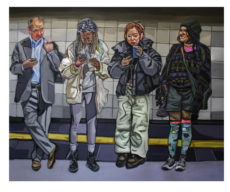
Emily Gillbanks Waiting for Things, 2023 Oil on Canvas 63 x 78 3/4 in 160 x 200 cm