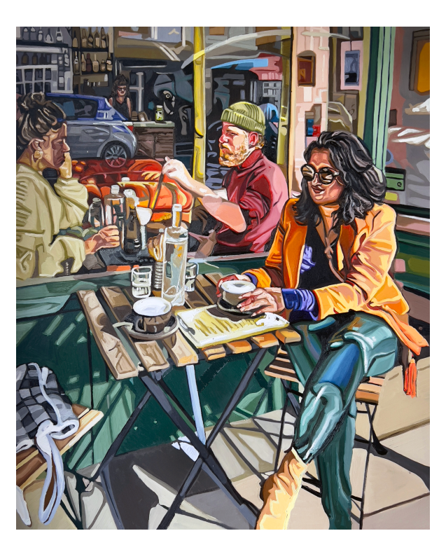
Emily Gillbanks To Have-In, Or To Take-Away?, 2023 Oil paint on canvas 70 7/8 x 55 1/8 in 180 x 140 cm