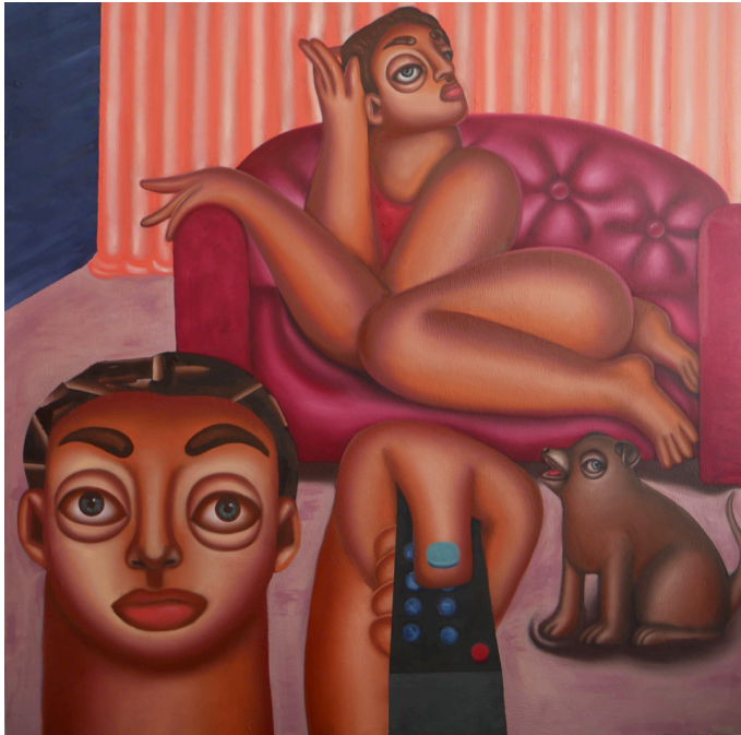
Georgia Dymock Netflix and Chill , 2022 Oil on linen 66 7/8 x 66 7/8 in 170 x 170 cm