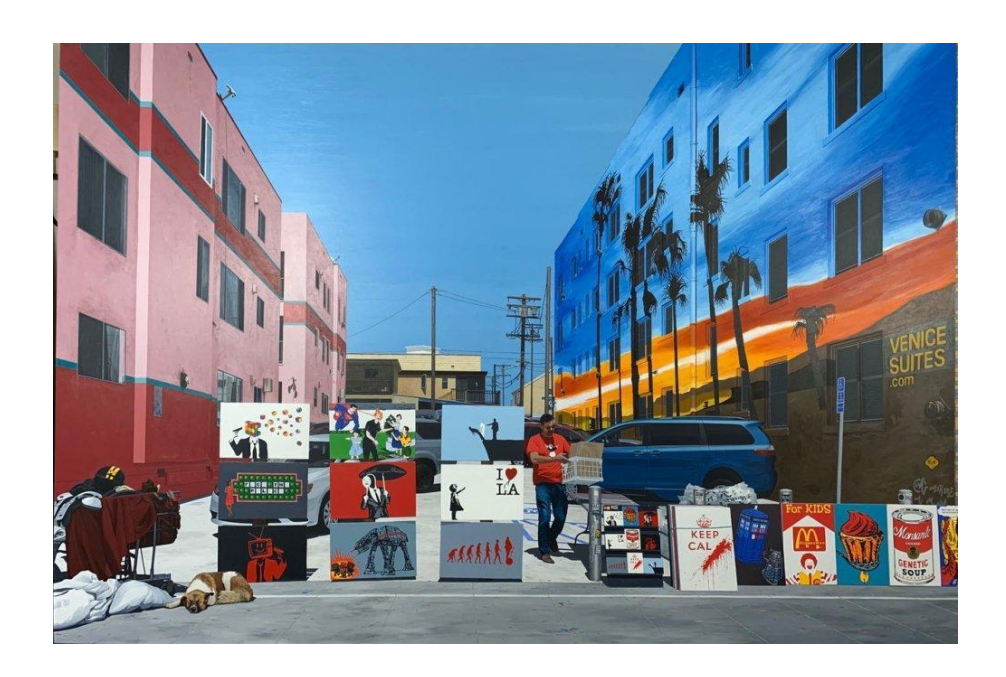
Darren Reid The Painter, 2018 Acrylic on panel 120x180cm