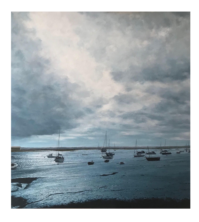
Darren Reid Falling Light, 2018 Oil on Panel 60 \times 60 cm