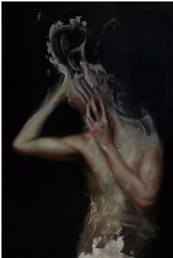
Henrik Uldalen Cascade , 2022 Oil on linen 70 7/8 x 47 1/4 in 180 x 120 cm