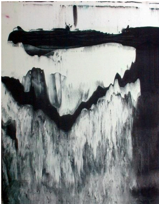
Ed Moses Offed Reason , 1999 Acrylic on canvas 142.2 x 111.8 cm