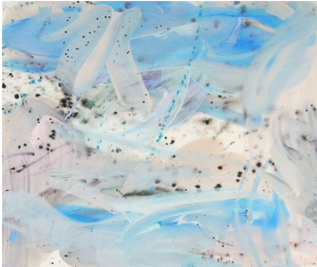
Ed Moses Alping , 2007 Acrylic on canvas 152 x 182.9cm