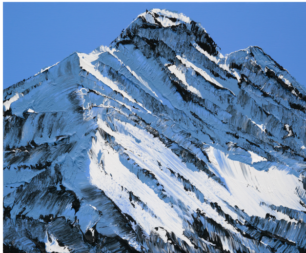
Conrad Jon Godly RENAISSANCE#21 , 2024 Acrylic on canvas 39 3/8 x 47 1/4 in 100 x 120 cm