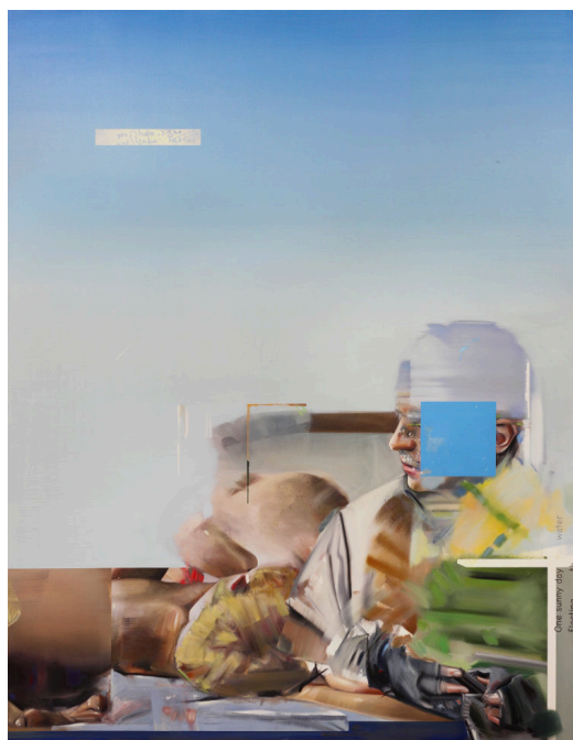
Phoebe Leech Justin Mortimer , 2025 Oil on linen 84 1/4 x 63 in 214 x 160 cm