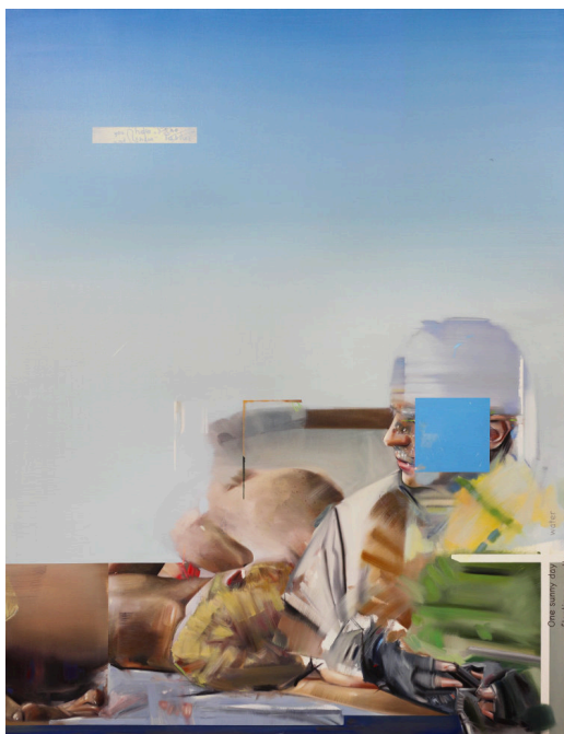
Phoebe Leech Justin Mortimer , 2025 Oil on linen 84 1/4 x 63 in 214 x 160 cm