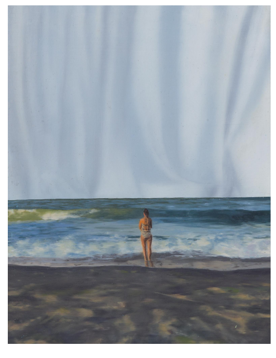
Marcel Rusu The Curtain, 2018 Oil on wood 9 7/8 x 7 1/2 in 25 x 19 cm