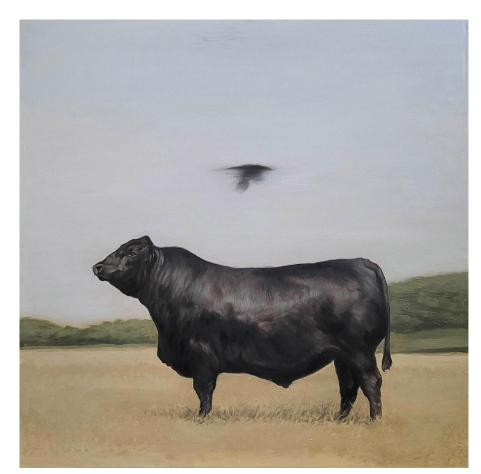
Cătălin Tăvală AEROB VS ANAREOB, 2023 Oil on canvas 31 1/2 x 31 1/2 in 80 x 80 cm