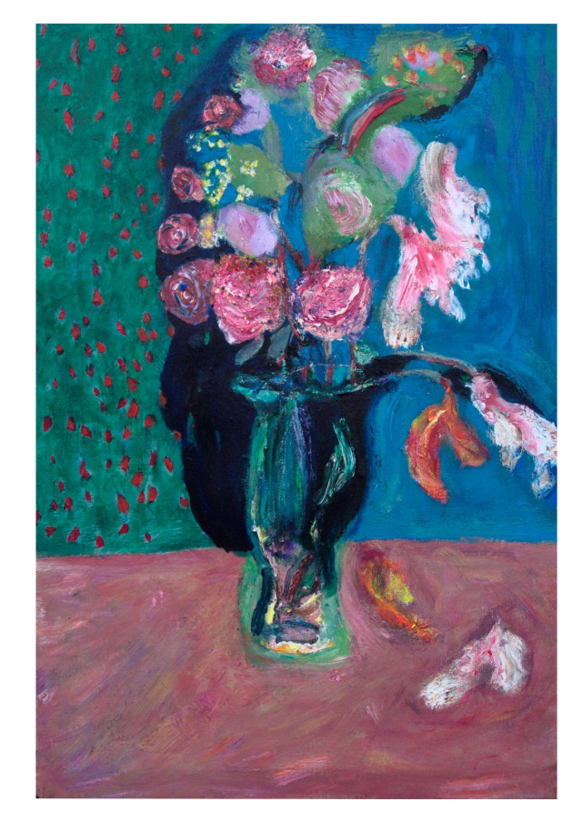
Andrew Litten, Flowers , 2023, Oil on canvas, 33 1/2 x 21 5/8 in, 85 x 55 cm

JD Malat Gallery is delighted to present Andrew Litten's enchanting works, powerfully emotive and moving, in its London gallery space. Litten has been exhibiting globally, in the United States, China, United Kingdom (including Tate Modern), Germany, Belgium and Italy. The exhibition catalogue of 'Connect' will be accompanied by an