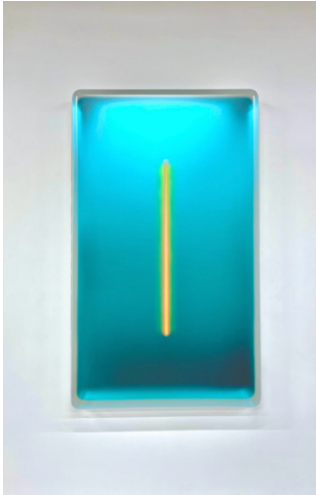
Casper Brindle Light Glyph 6, 2021 Plexiglas, pigmented acrylics 188 x 112 cm

A landmark exhibition featuring thirteen international artists exploring illumination, perception, and contemporary expression.