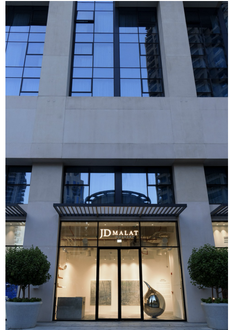
JD MALAT GALLERY DUBAI IN DOWNTOWN