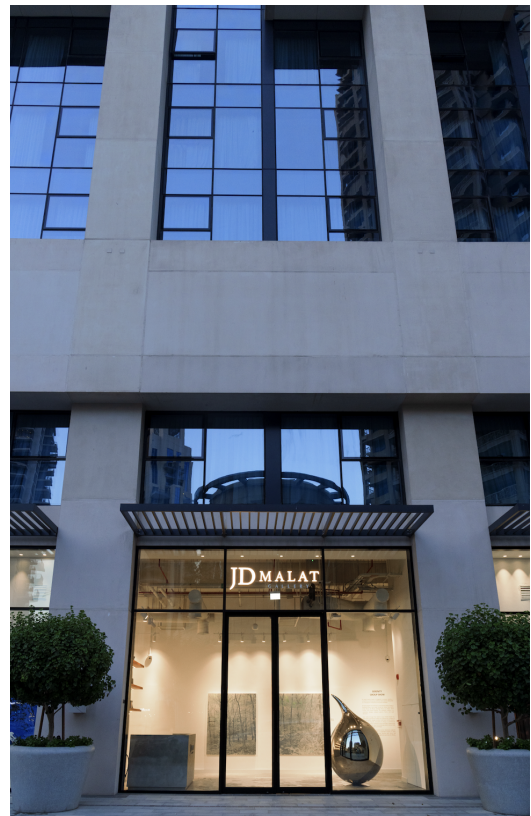
JD MALAT GALLERY DUBAI IN DOWNTOWN