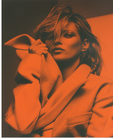
Bryan Adams Kate Moss, Pose, London, 2013 143 x 110 cm