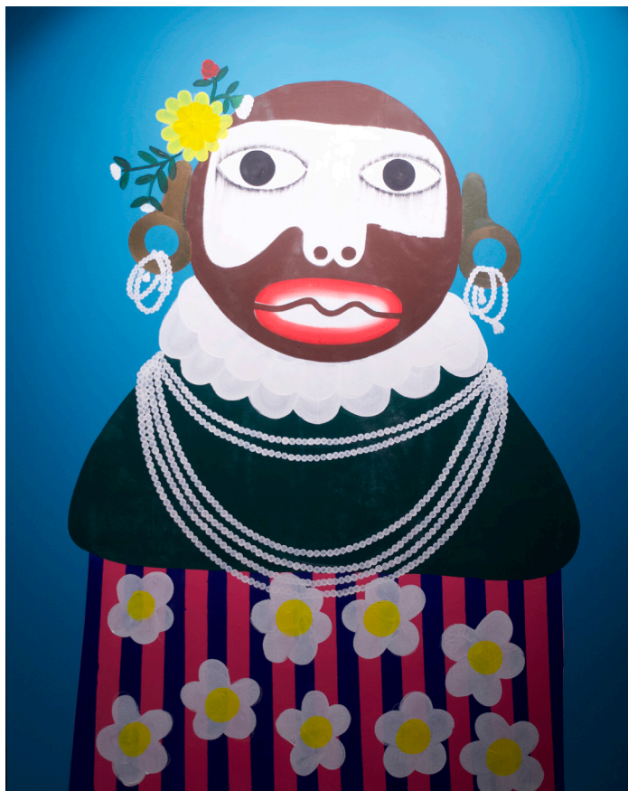
Kojo Marfo Stranger , 2024 Acrylic on canvas 69 1/2 x 56 1/8 in 176.5 x 142.5 cm