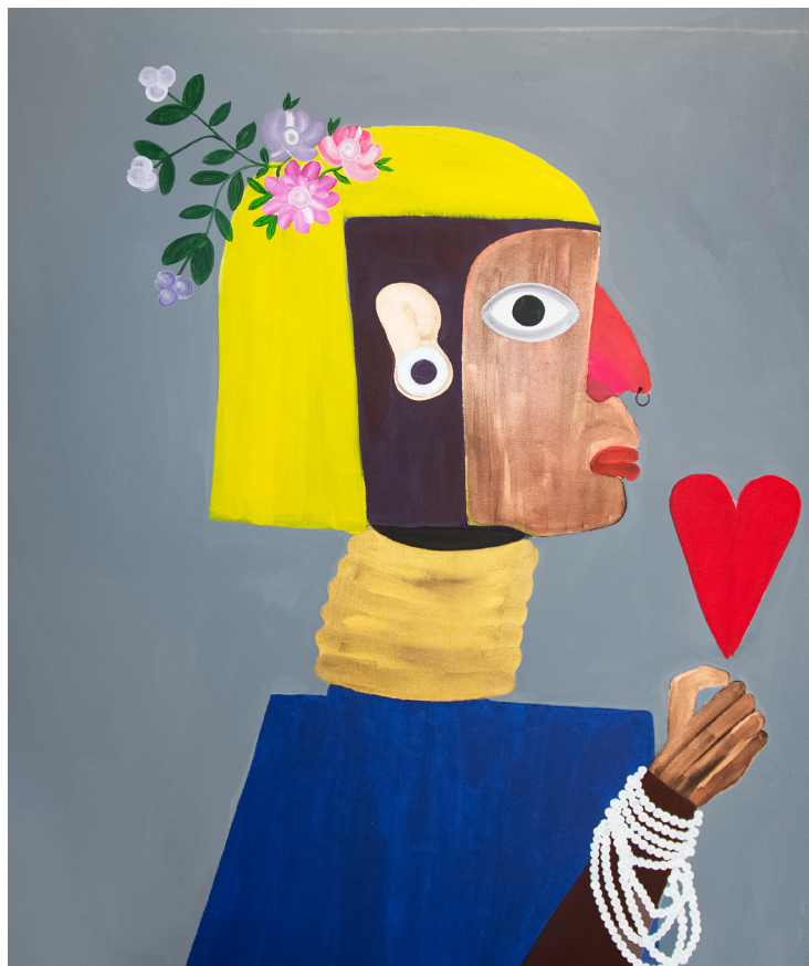
Kojo Marfo Breathing Life , 2023 Acrylic on canvas 66 3/4 x 54 7/8 in 169.5 x 139.5 cm