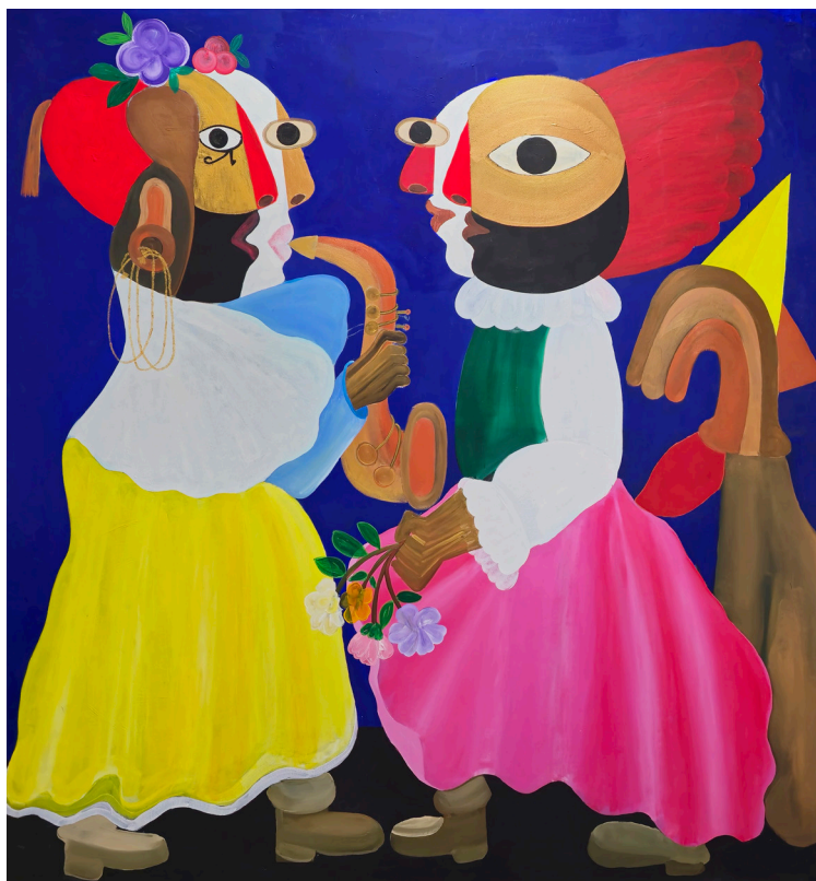
Kojo Marfo Euphoria , 2025 Acrylic on canvas 83 1/2 x 78 3/4 in 212 x 200 cm