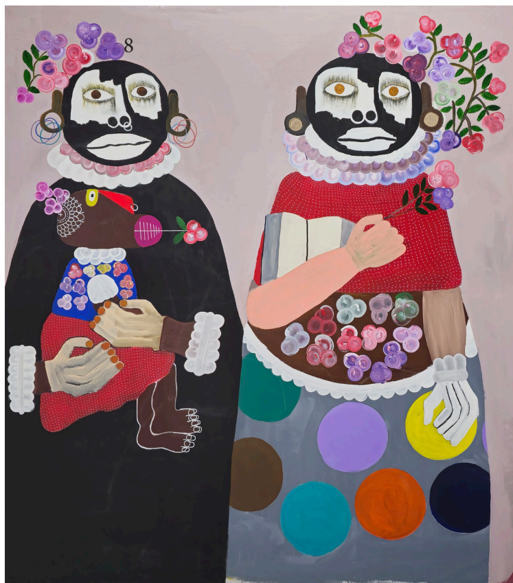
Kojo Marfo Wisdom and Grace , 2025 Acrylic on canvas 72 x 64 5/8 in 183 x 164 cm