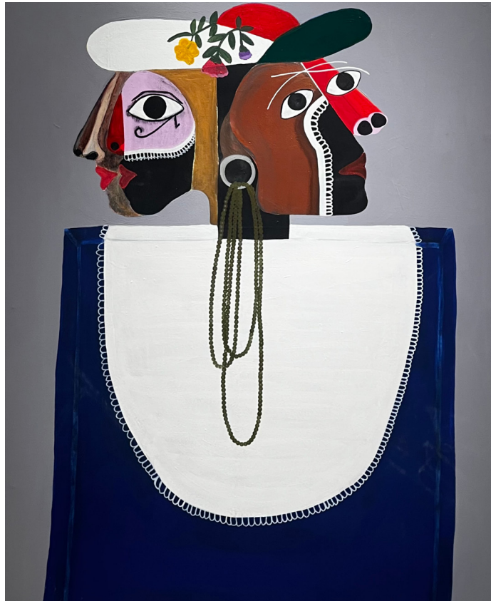
Kojo Marfo Elegance In Unity , 2024 Acrylic on canvas 70 7/8 x 59 in 180 x 150 cm