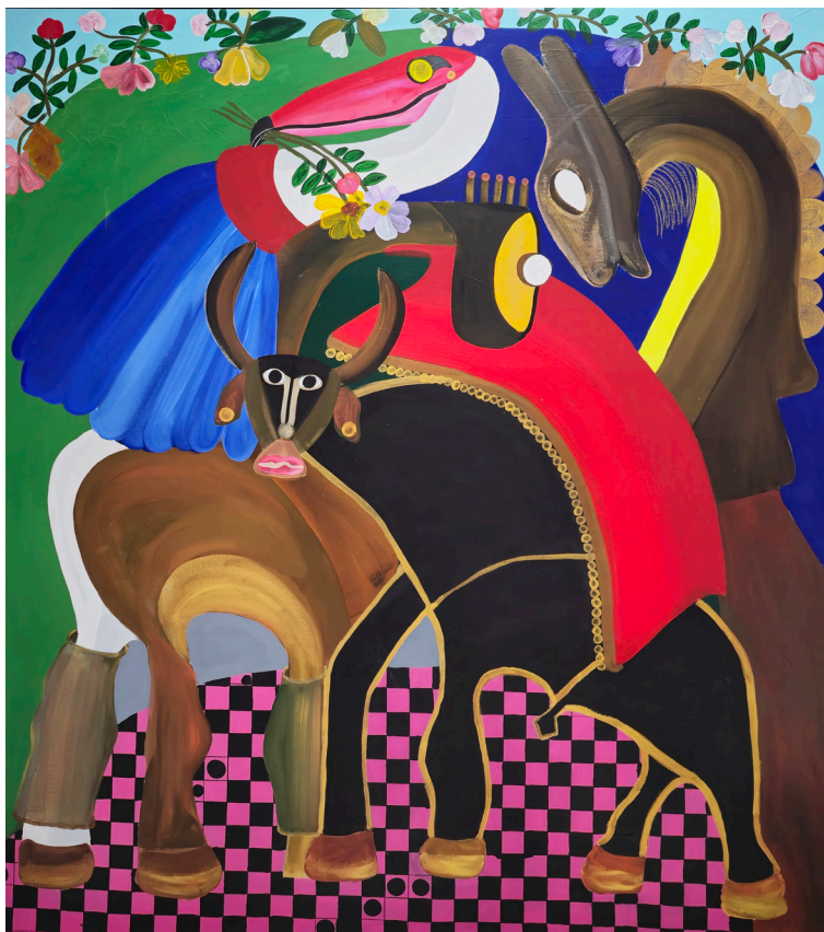
Kojo Marfo Harmony in Chaos , 2025 Acrylic on canvas 80 1/4 x 71 5/8 in 204 x 182 cm