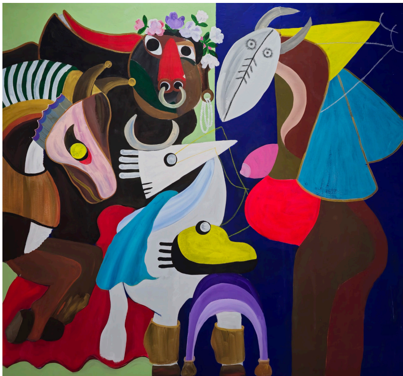
Kojo Marfo Fury and Freedom , 2025 Acrylic on canvas 84 5/8 x 78 3/4 in 215 x 200 cm