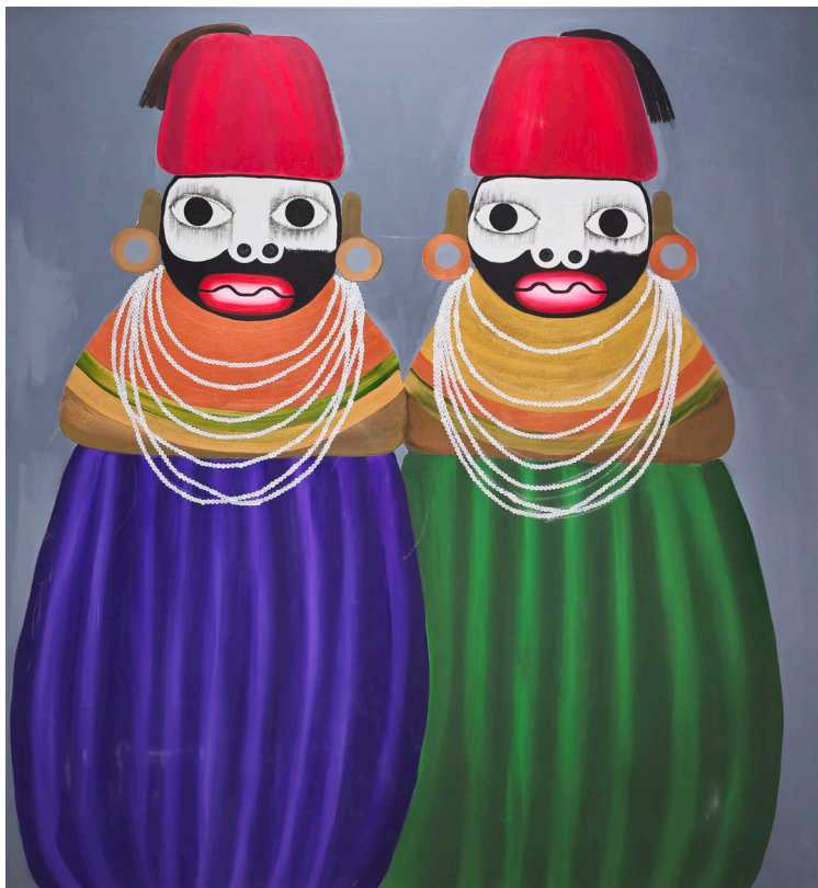
Kojo Marfo Minds In Motion , 2025 Acrylic on canvas 76 3/4 x 72 in 195 x 183 cm