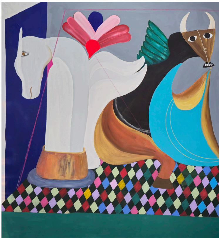
Kojo Marfo Rhythms of the Soul , 2025 Acrylic on canvas 72 7/8 x 68 1/2 in 185 x 174 cm