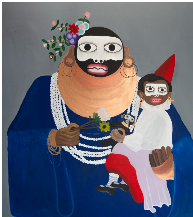
Kojo Marfo Crucible , 2023 Acrylic on canvas 74 3/8 x 65 3/4 in 189 x 167 cm