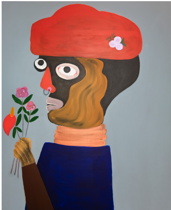
Kojo Marfo Reborn , 2023 Acrylic on canvas 67 3/8 x 54 in 171 x 137 cm