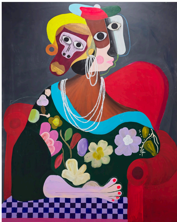
Kojo Marfo Shadow of moonlight , 2025 Acrylic on canvas 82 1/4 x 65 3/4 in 209 x 167 cm