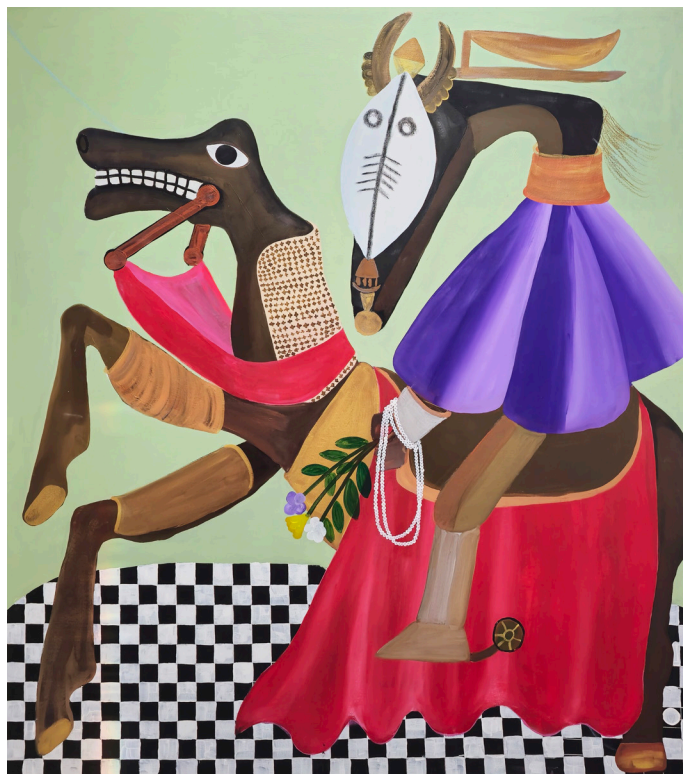
Kojo Marfo Solstride , 2025 Acrylic on canvas 80 3/4 x 71 5/8 in 205 x 182 cm