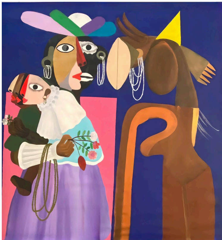
Kojo Marfo Saddle and Sceptre , 2024 Acrylic on canvas Framed dimensions: 77 1/2 x 71 1/4 in 197 x 181 cm