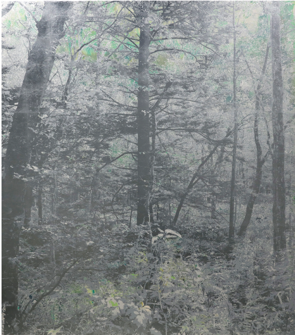
Mirage #101 | 2024

Cotton on panel, acrylic, silver foil, aluminium foil 66 7/8 x 59 in 170 x 150 cm