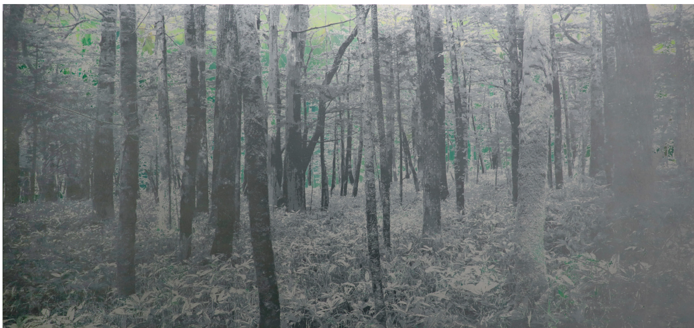
Mirage #103 | 2024

Cotton on panel, acrylic, silver foil, aluminum foil 43 1/4 x 90 1/2 x 2 3/8 in 110 x 230 x 6 cm