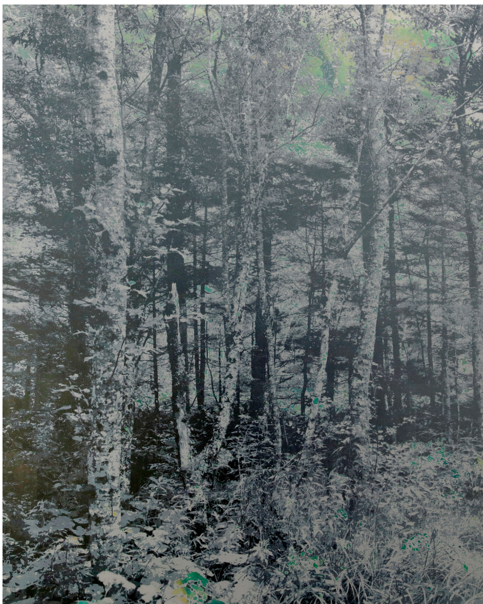
Mirage #105 | 2024

Cotton on panel, acrylic, silver foil, aluminium foil 39 3/8 x 31 1/2 x 1 1/8 in 100 x 80 x 3 cm