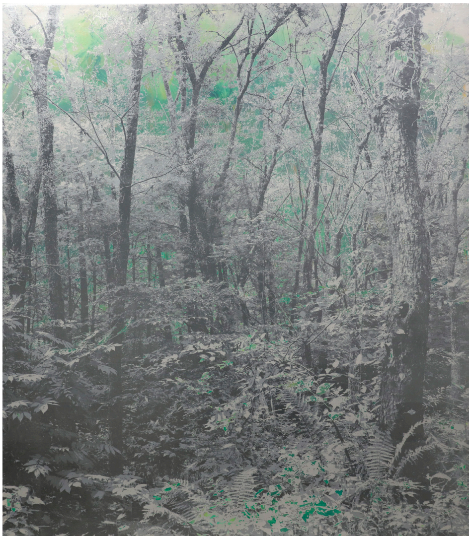
Mirage #98 | 2024

Cotton on panel, acrylic, silver foil, aluminium foil 66 7/8 x 59 in 170 x 150 cm