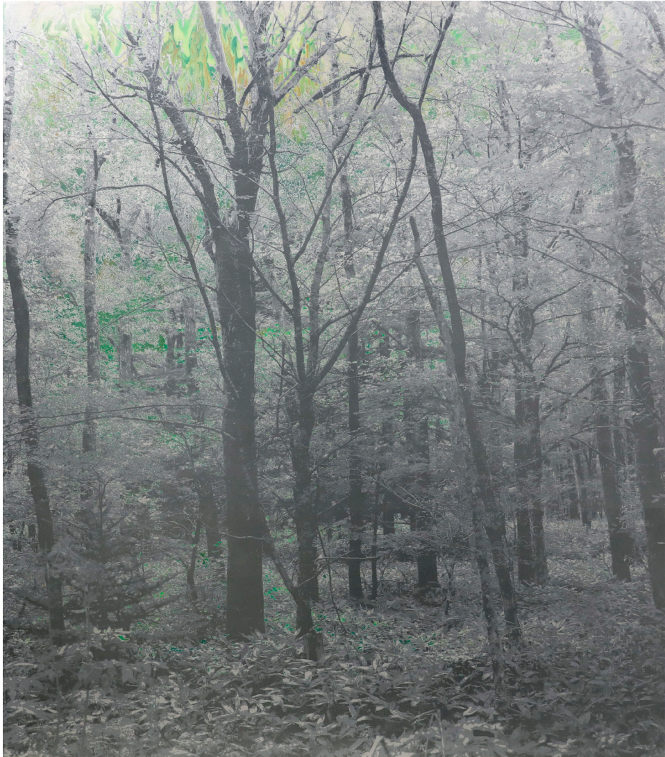
Mirage #99 | 2024

Cotton on panel, acrylic, silver foil, aluminium foil 66 7/8 x 59 in 170 x 150 cm