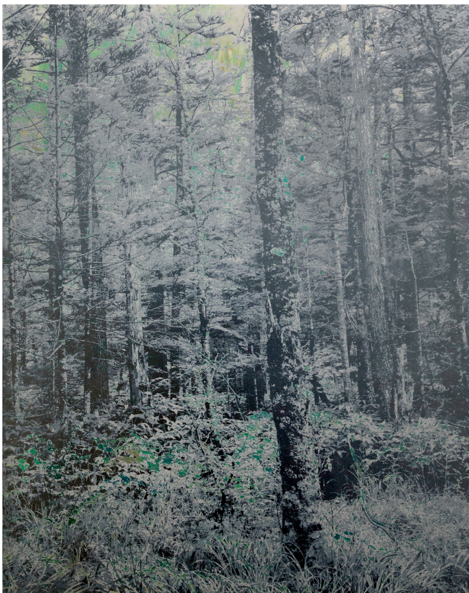
Mirage #106 | 2024

Cotton on panel, acrylic, silver foil, aluminium foil 39 3/8 x 31 1/2 x 1 1/8 in 100 x 80 x 3 cm