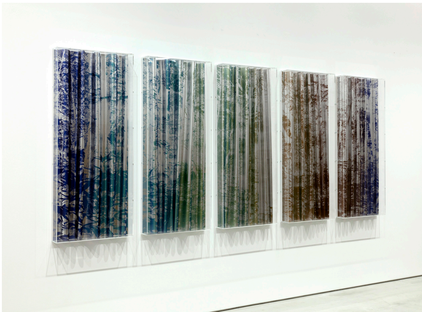
Flicker | 2023

Acrylic board on panel, transparent film, acrylic paint, aluminum foil 50 3/8 x 23 1/4 x 6 3/4 in 128 x 59.1 x 17 cm (each panel)