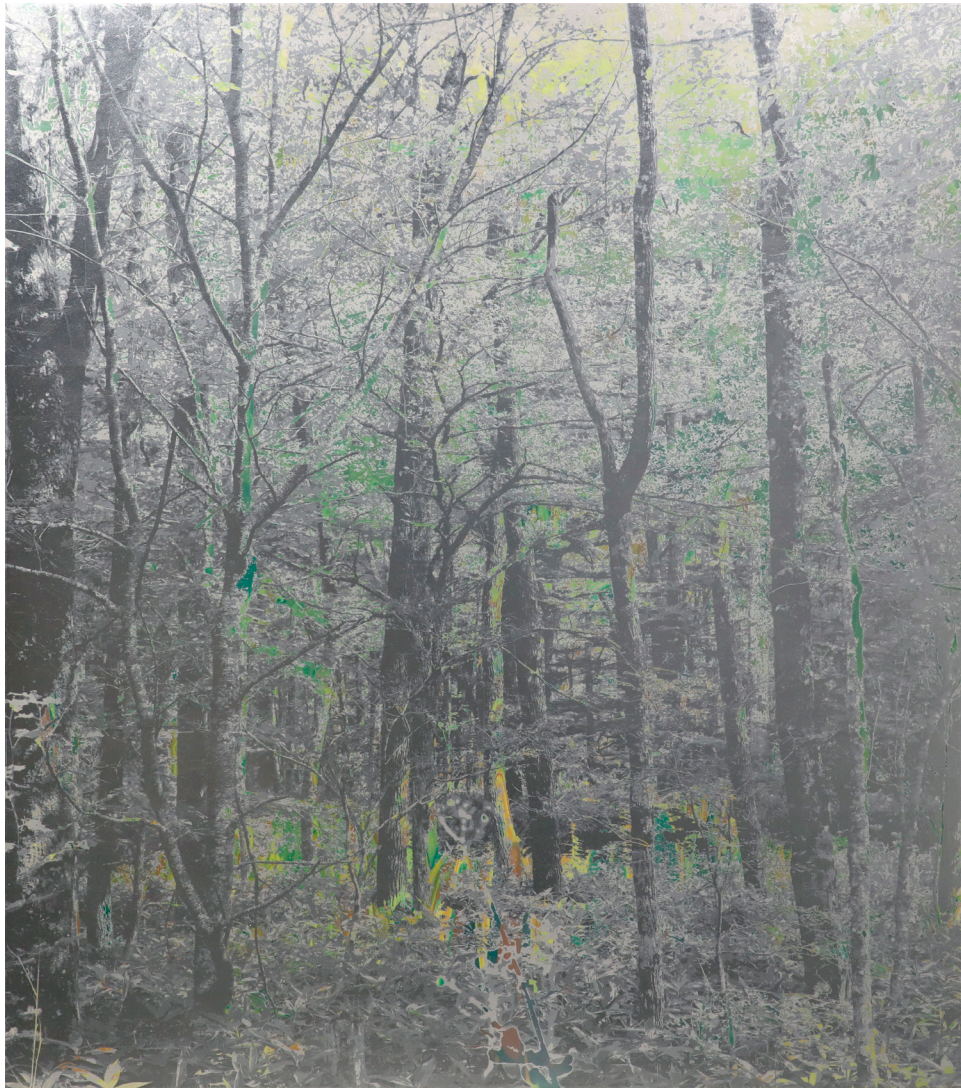
Mirage #102 | 2024

Cotton on panel, acrylic, silver foil, aluminium foil 66 7/8 x 59 in 170 x 150 cm