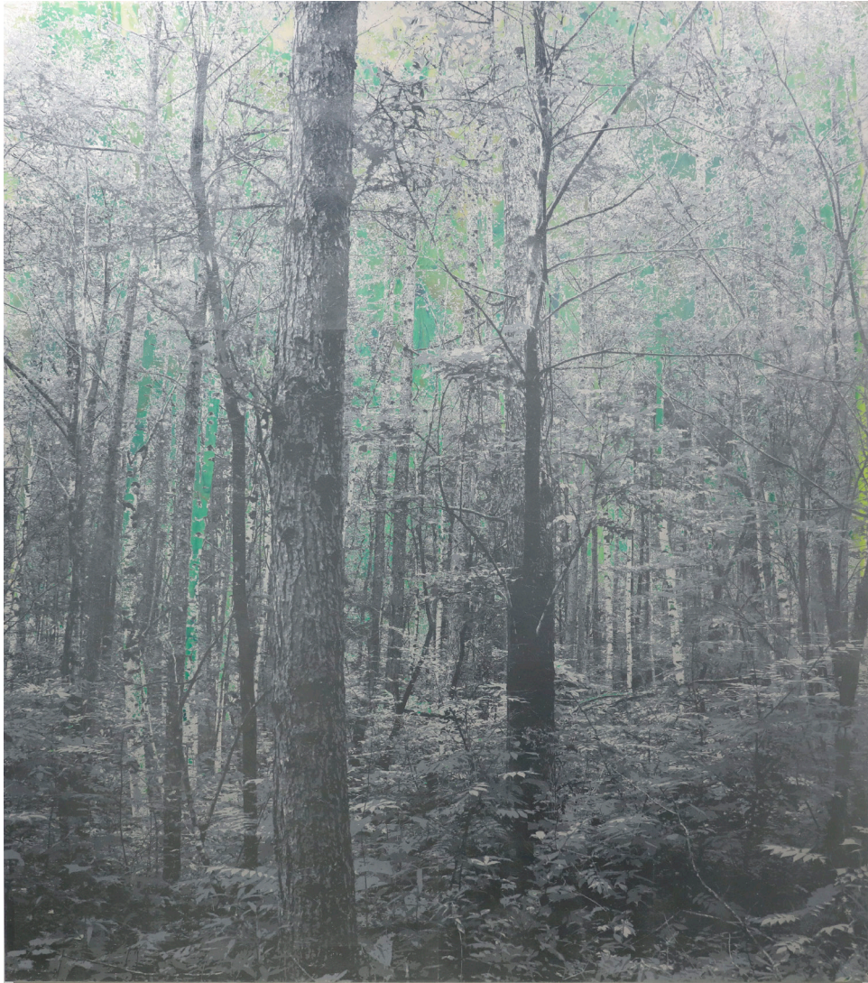
Mirage #100 | 2024

Cotton on panel, acrylic, silver foil, aluminium foil 66 7/8 x 59 in 170 x 150 cm