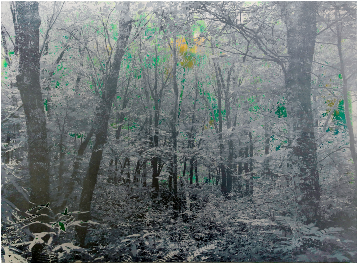
Mirage #104 | 2024

Cotton on panel, acrylic, silver foil, aluminium foil 43 1/4 x 59 x 2 in 110 x 150 x 5 cm