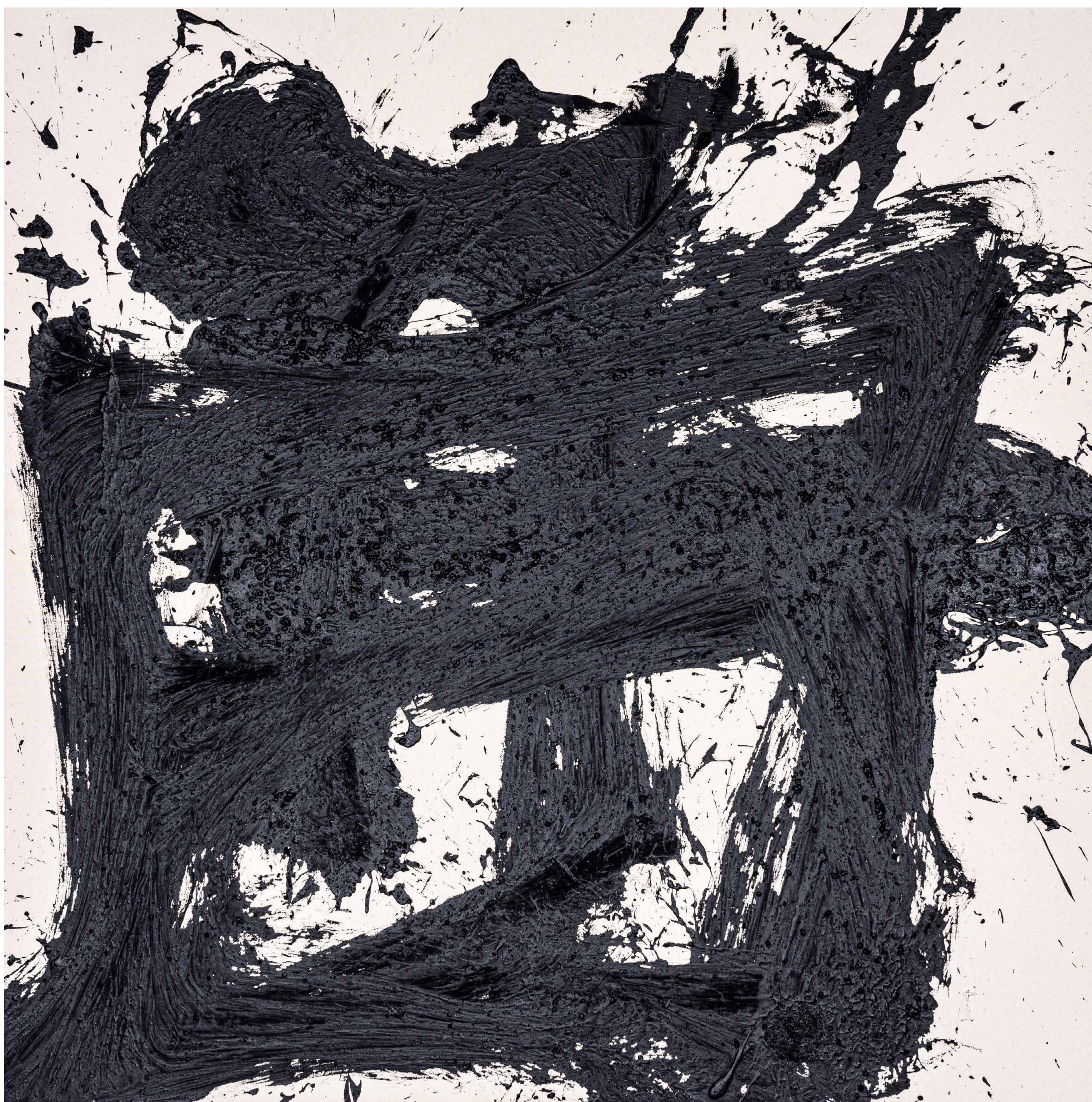
Untitled, 2023 Acrylic on canvas 59 7/8 x 59 in 152 x 150 cm