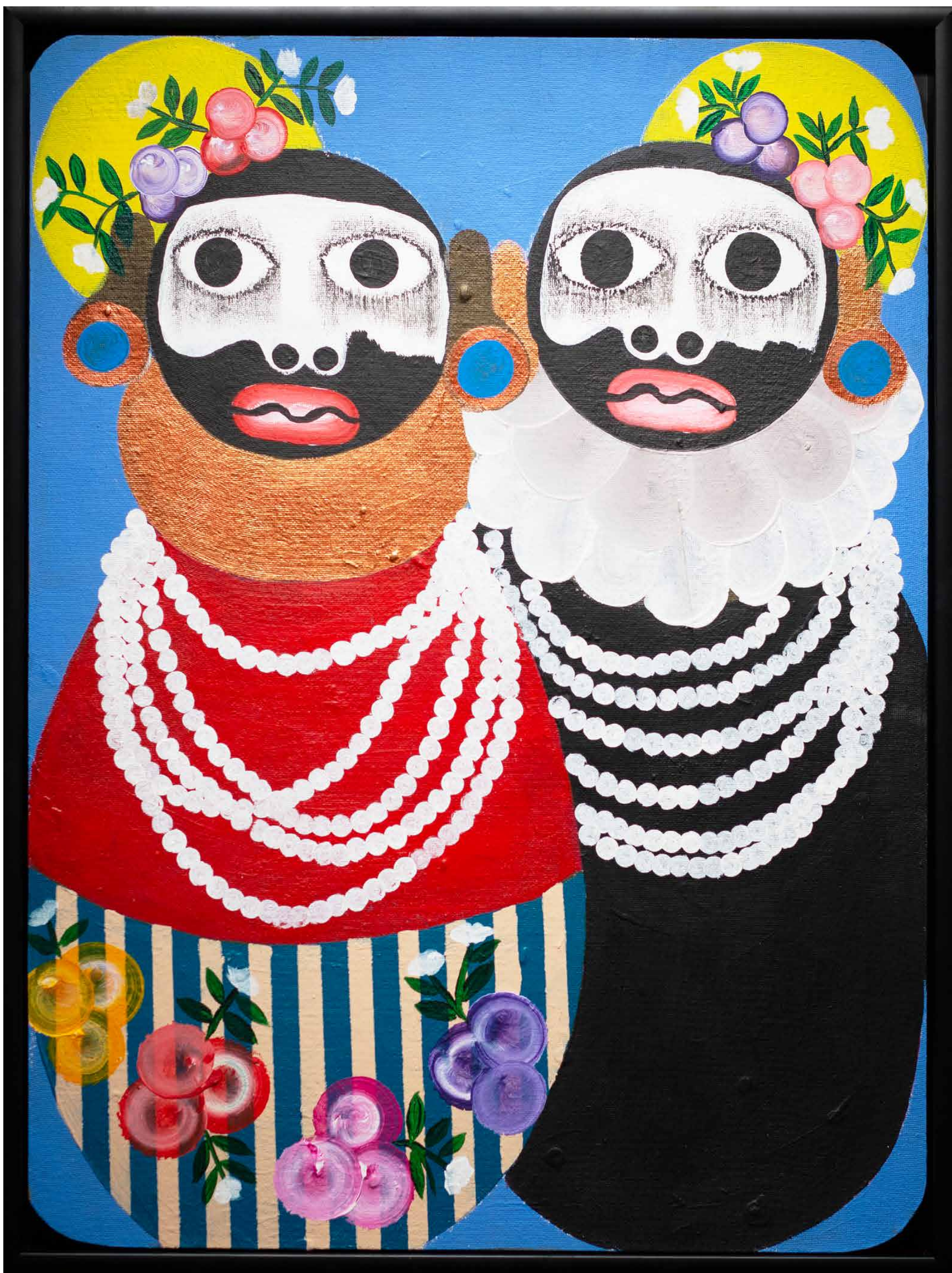
Wings of Hope , 2024 Acrylic on paperboard Framed: 32 1/4 x 24 3/8 in 82 x 62 cm Unframed: 30 3/4 x 22 7/8 in 78 x 58 cm