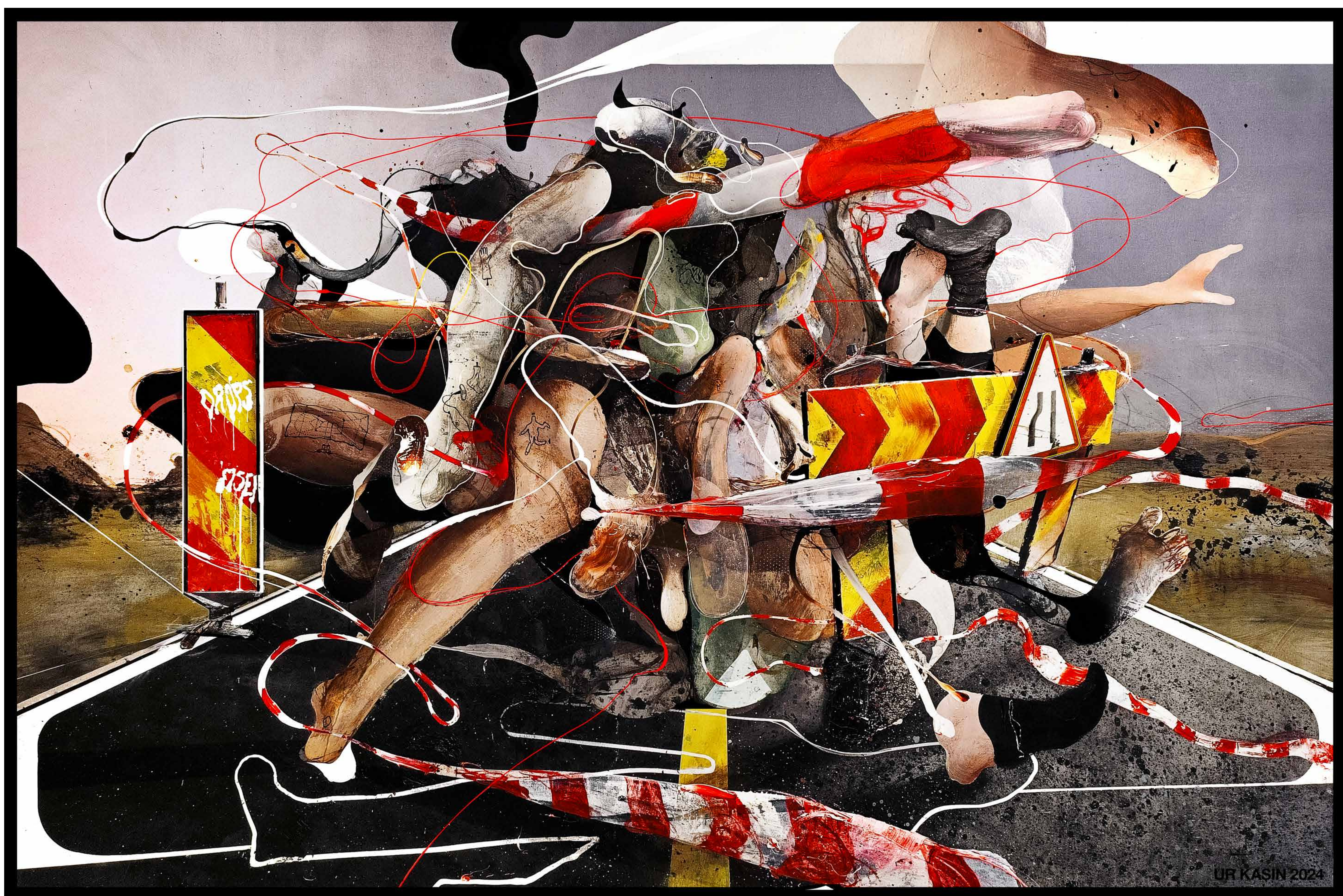
Roadblock, 2024 Oil on canvas 78 3/4 x 118 1/8 in 200 x 300 cm