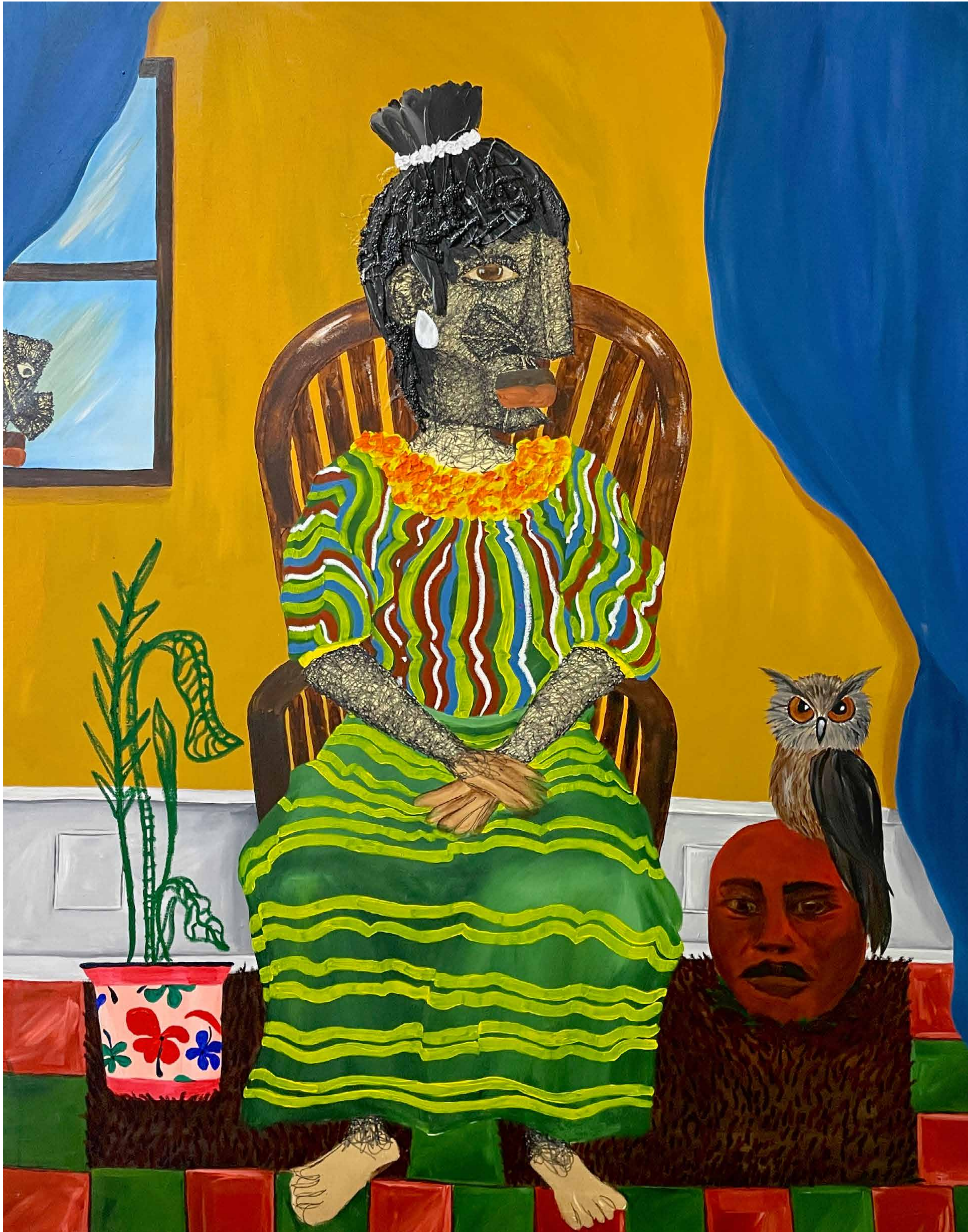
The Story of Olajumoke, 2023 Ink, Acrylic, Oil Pastel and Fabric on canvas 60 x 48 in 152.4 x 121.9 cm