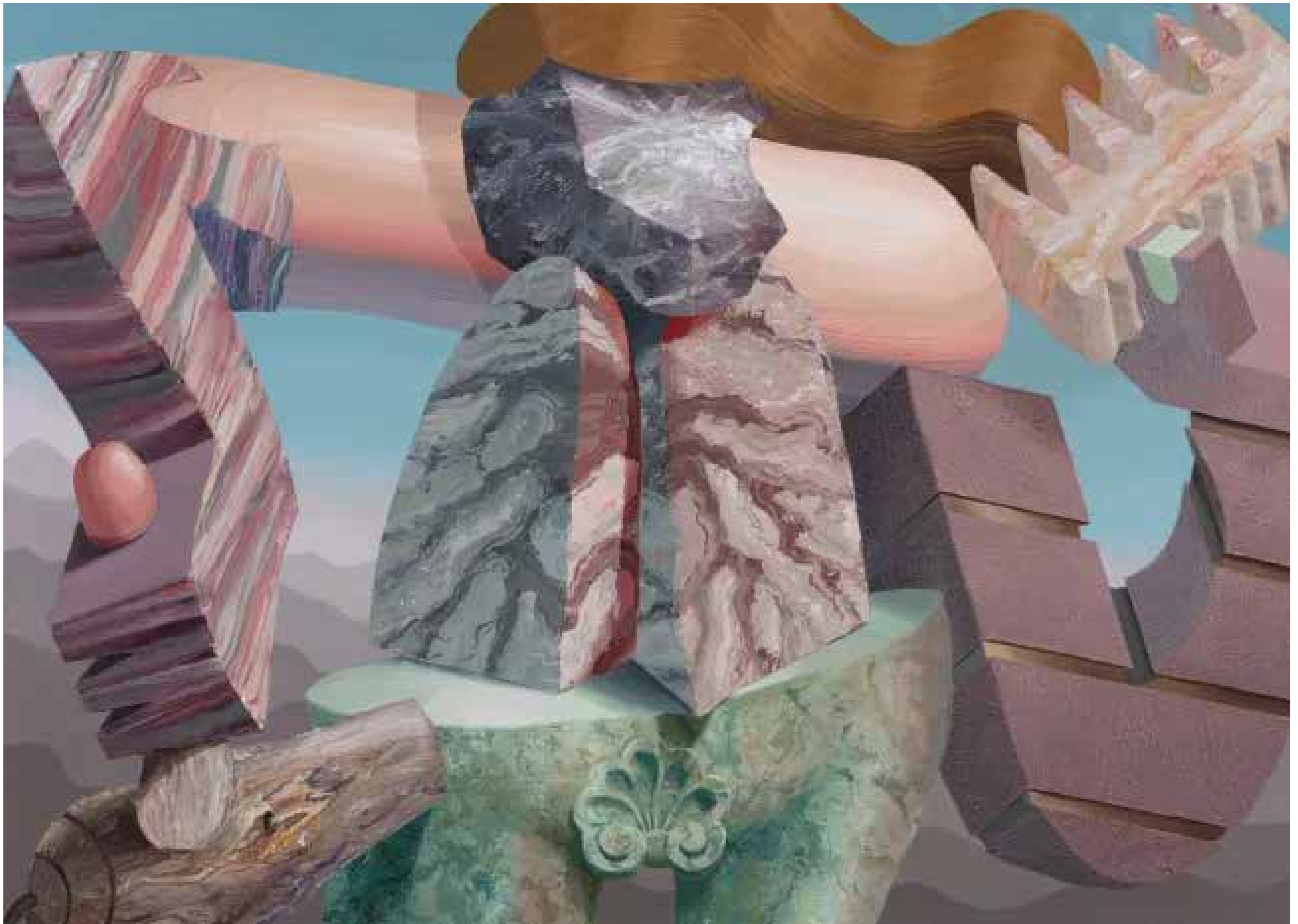
Venus Moves , 2023 Oil on canvas 39 3/8 x 55 1/8 in 100 x 140 cm