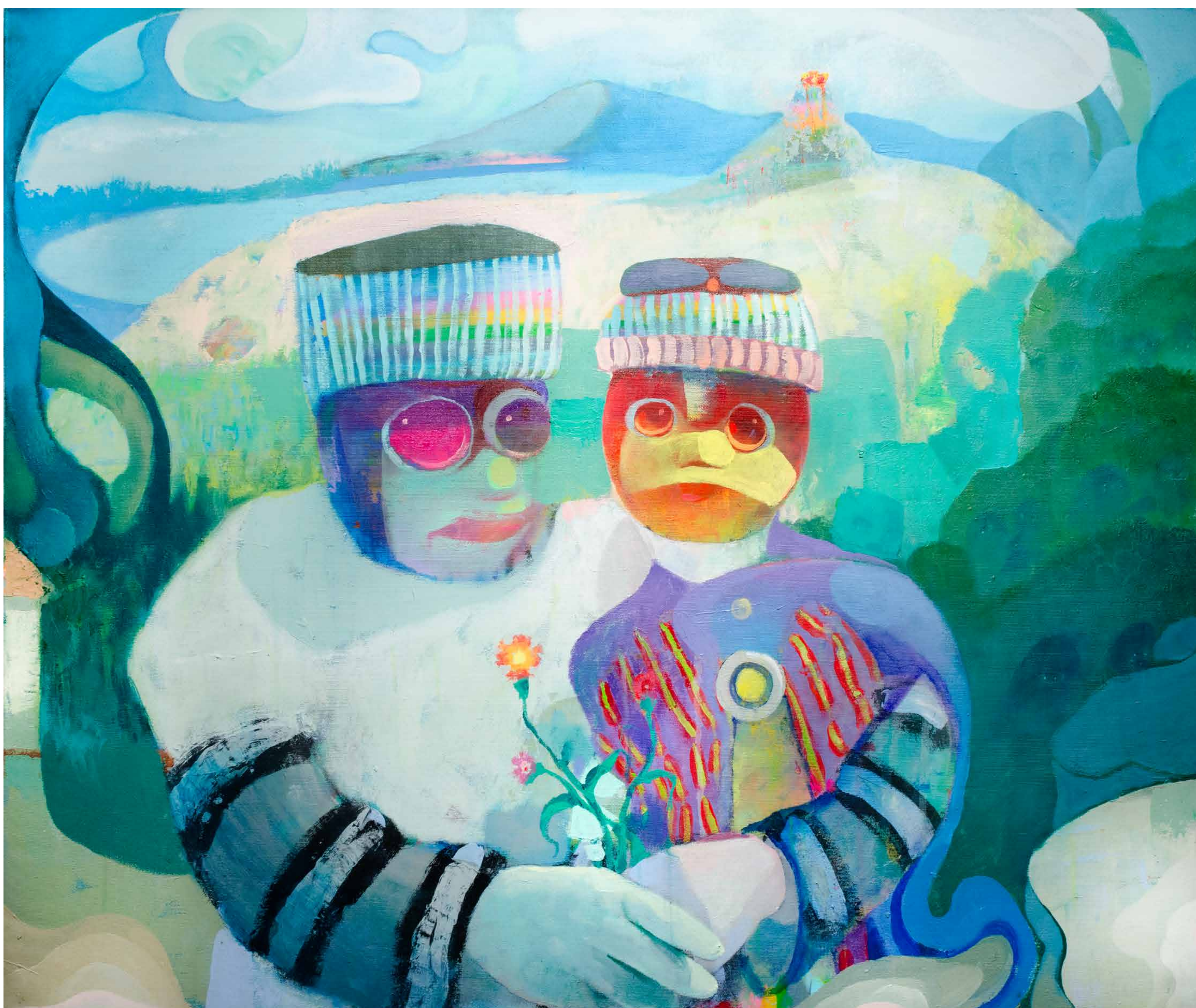
Naive Lovers, 2023 Acrylic on canvas 39 3/8 x 47 1/4 in 100 x 120 cm