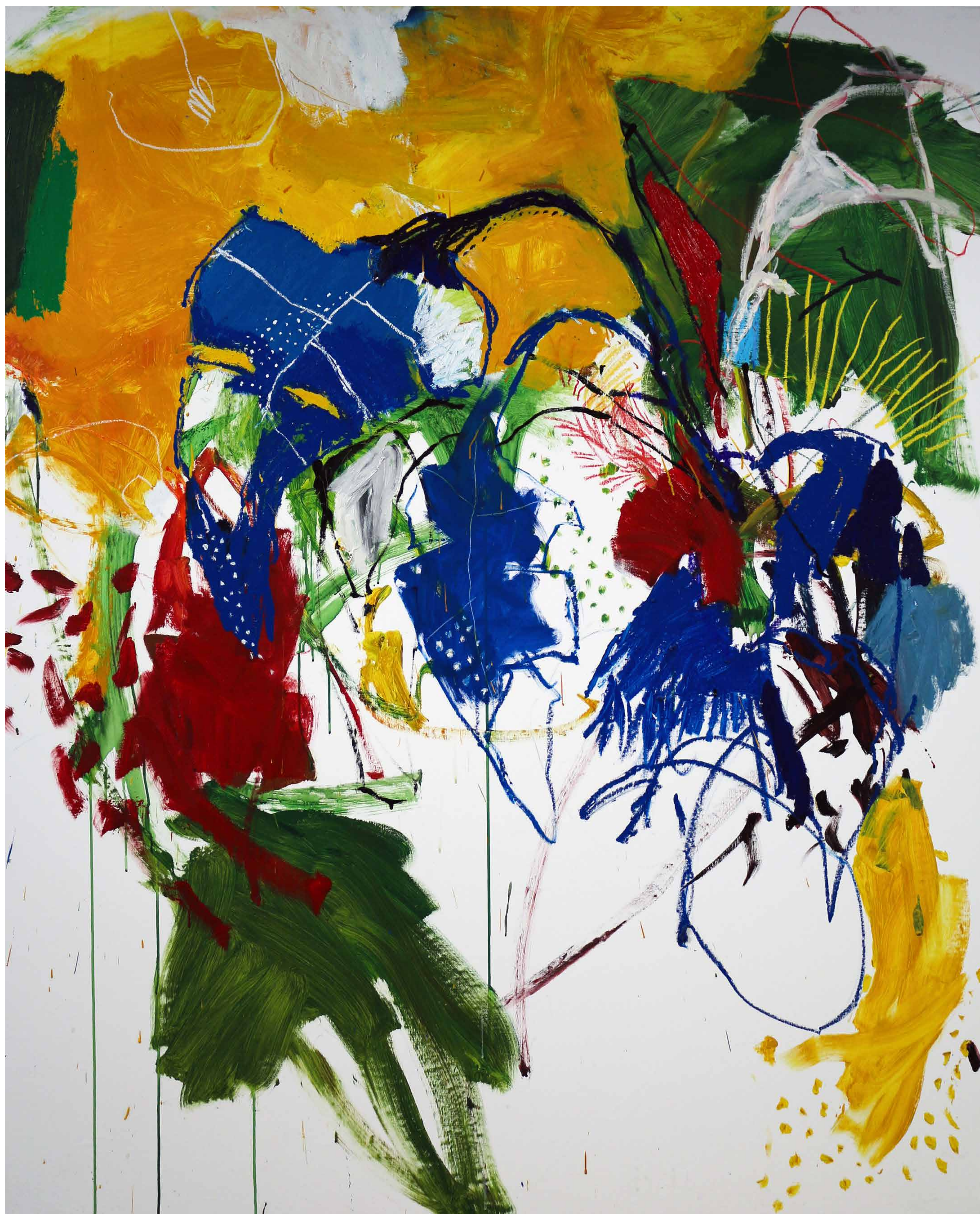
Composition for a blue banana tree, 2023 Oil, acrylic, oil bar and oil pastel on canvas 78 3/4 x 63 in 200 x 160 cm