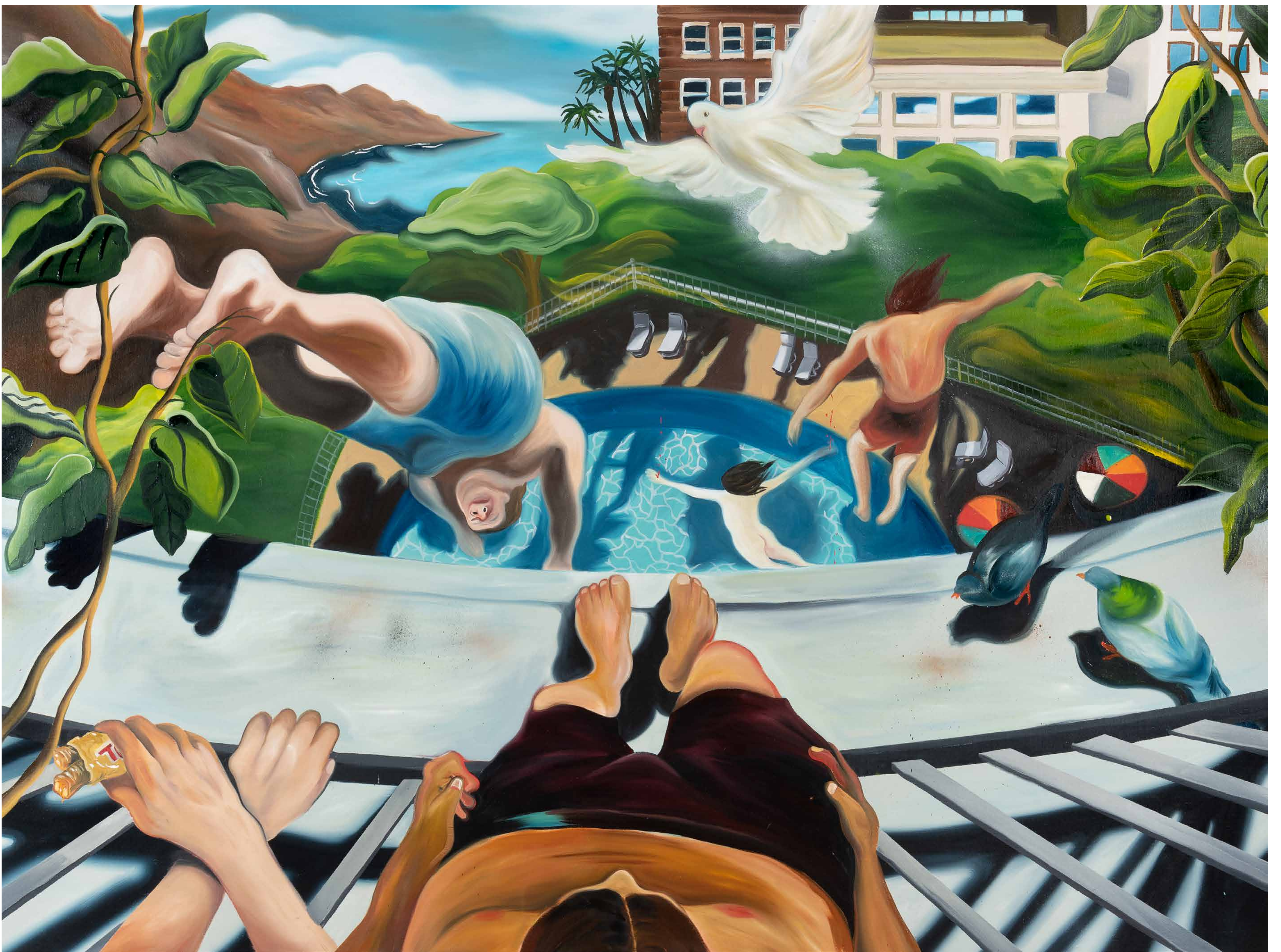
Balconing, 2023 Oil and airbrush on linen 135 x 180 cm 53 1/8 x 70 7/8 in