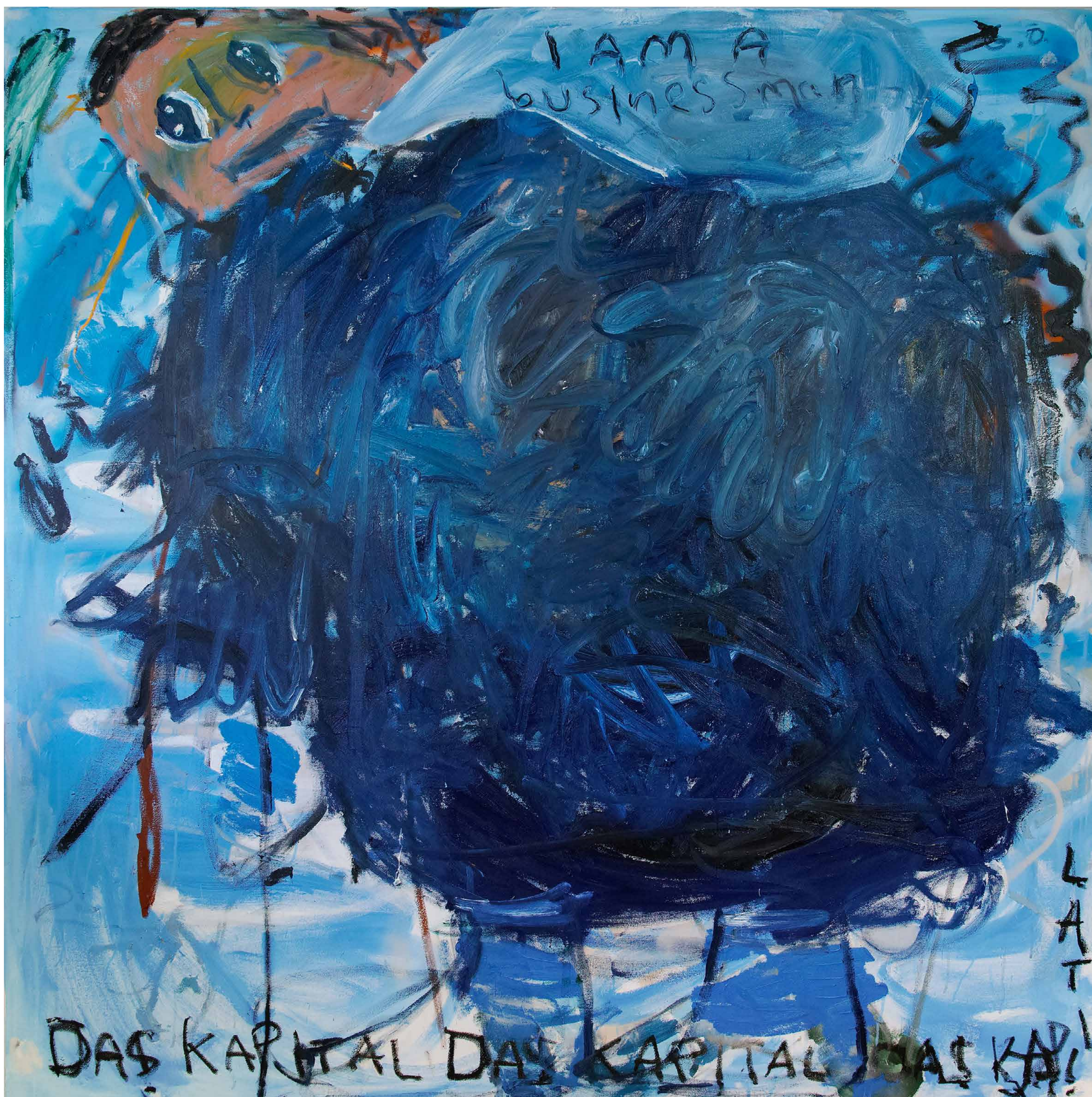
Das Kapital , 2021 Oil and acrylic on canvas 76 77/100 x 76 77/100 in 195 x 195 cm