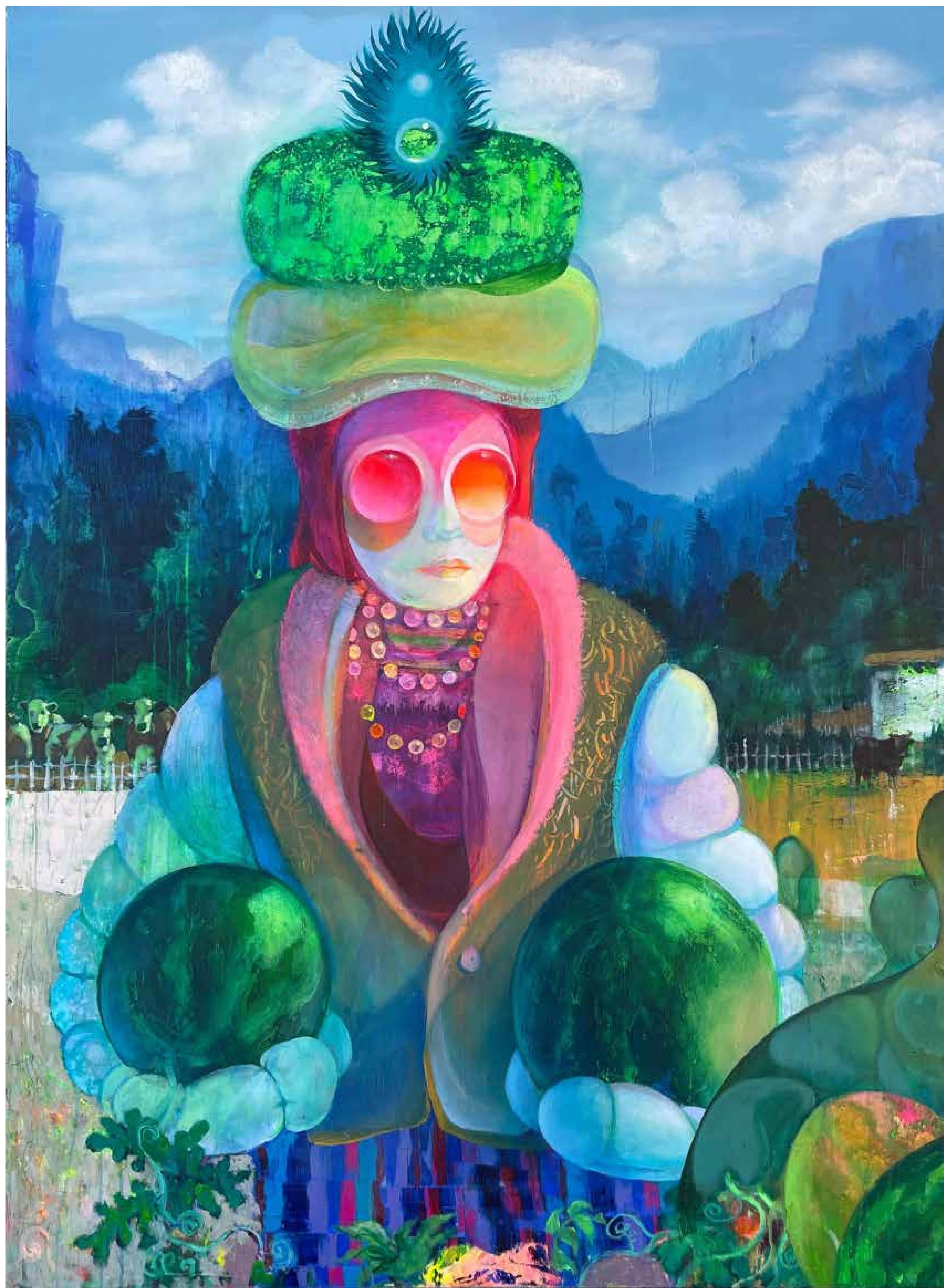
Watermelons, 2023 Acrylic on canvas 68 7/8 x 51 1/8 in 175 x 130 cm