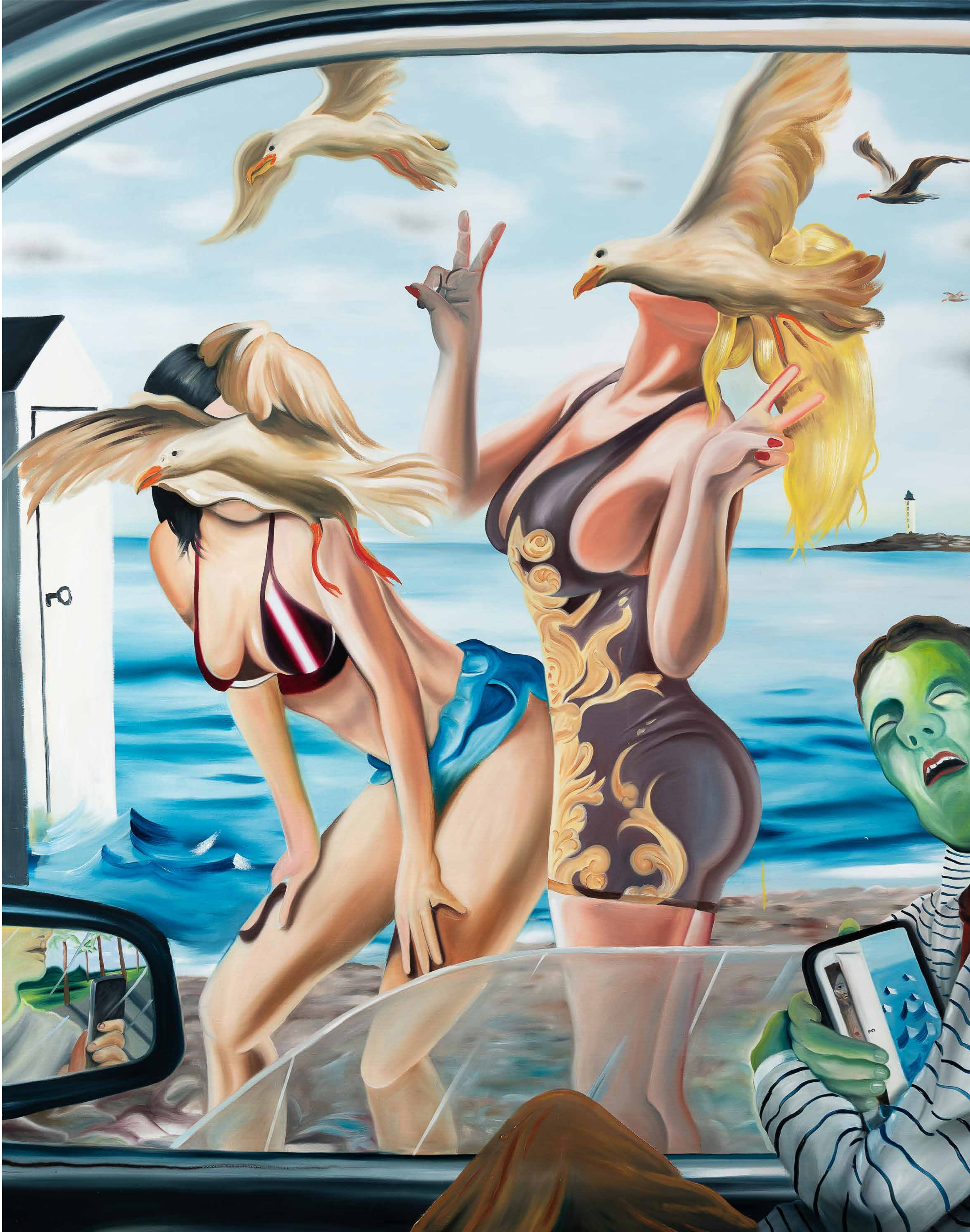
A Sleeping Man, 2023 Oil and airbrush on linen 180 x 140 x 3.5 cm 70 7/8 x 55 1/8 x 1 3/8 in