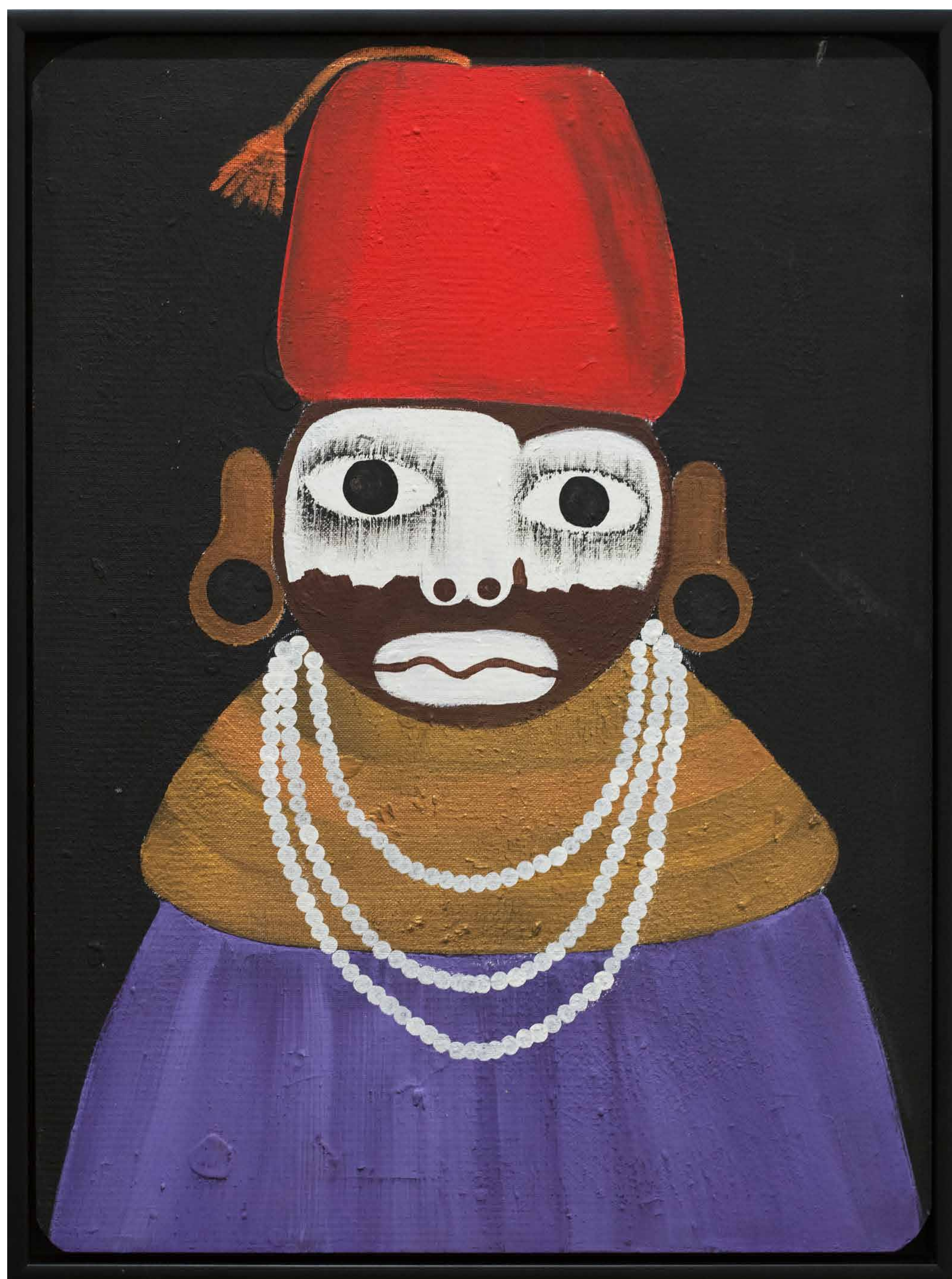
Boy in Red Hat, 2024 Acrylic on wood Framed: 32 1/4 x 24 3/8 in 82 x 62 cm Unframed: 30 3/4 x 22 7/8 in 78 x 58 cm