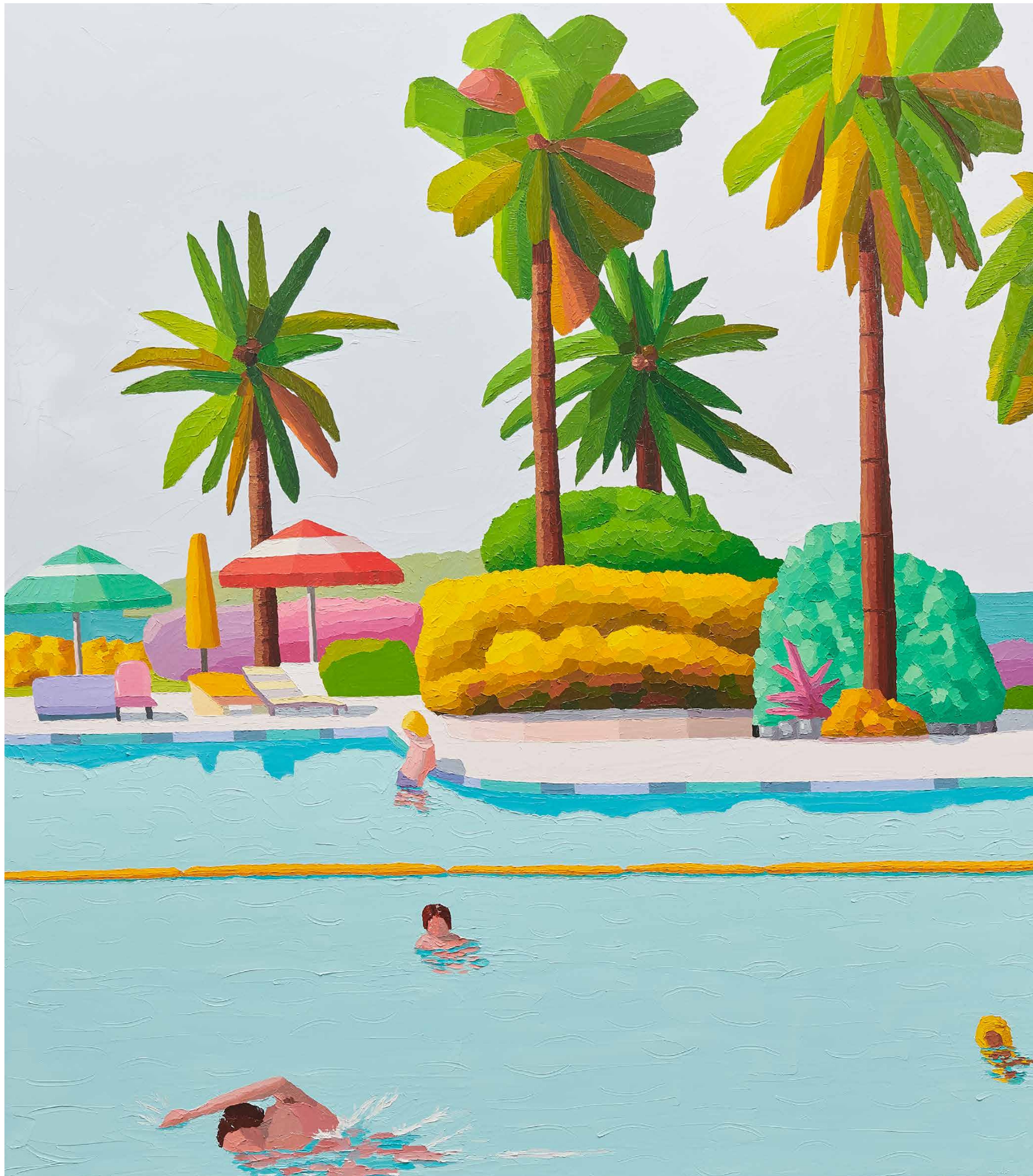
The waterline , 2024 Oil on linen 54 x 48 in 137 x 122 cm