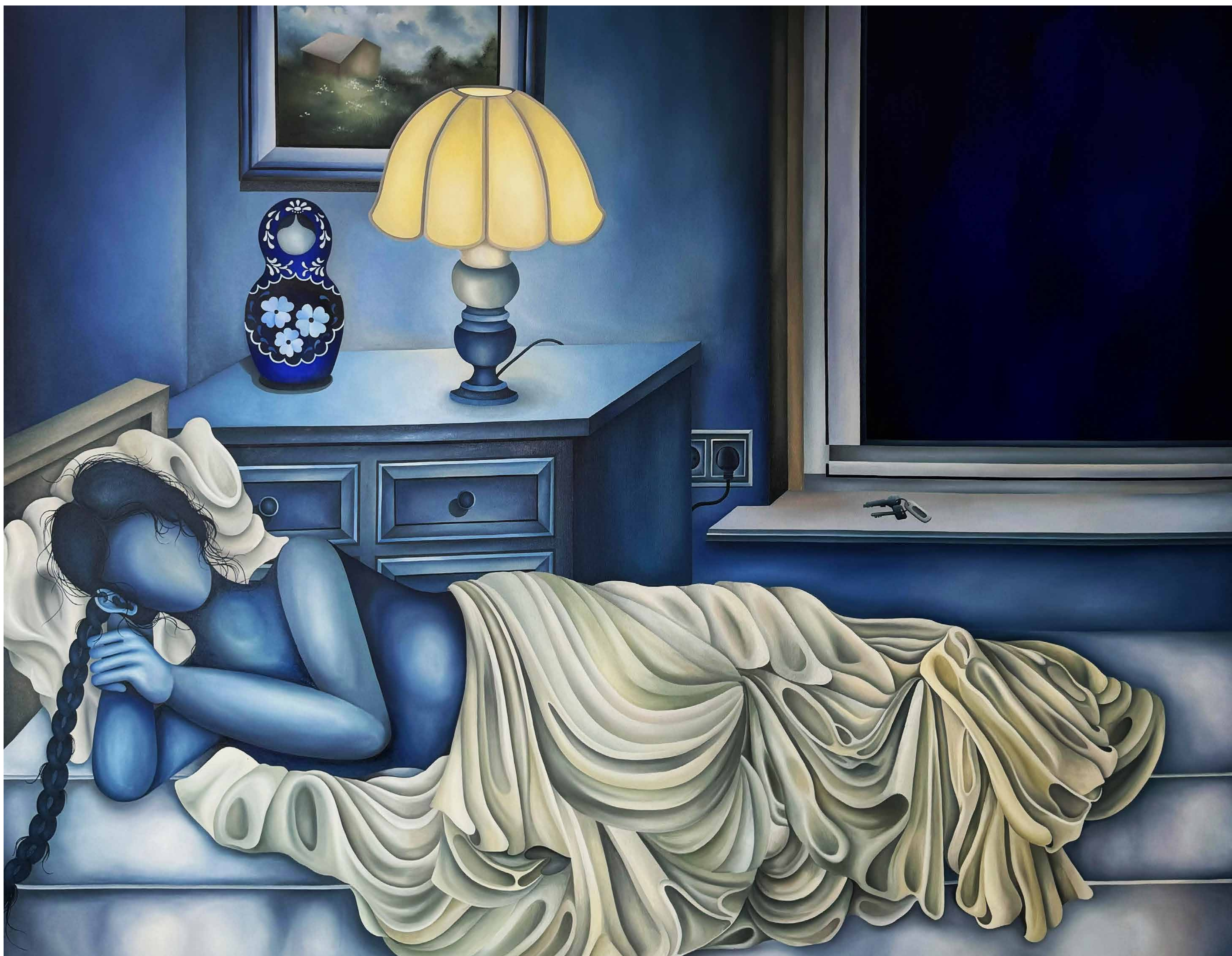
Night Thoughts , 2024 Oil on canvas 59 x 78 3/4 in 150 x 200 cm