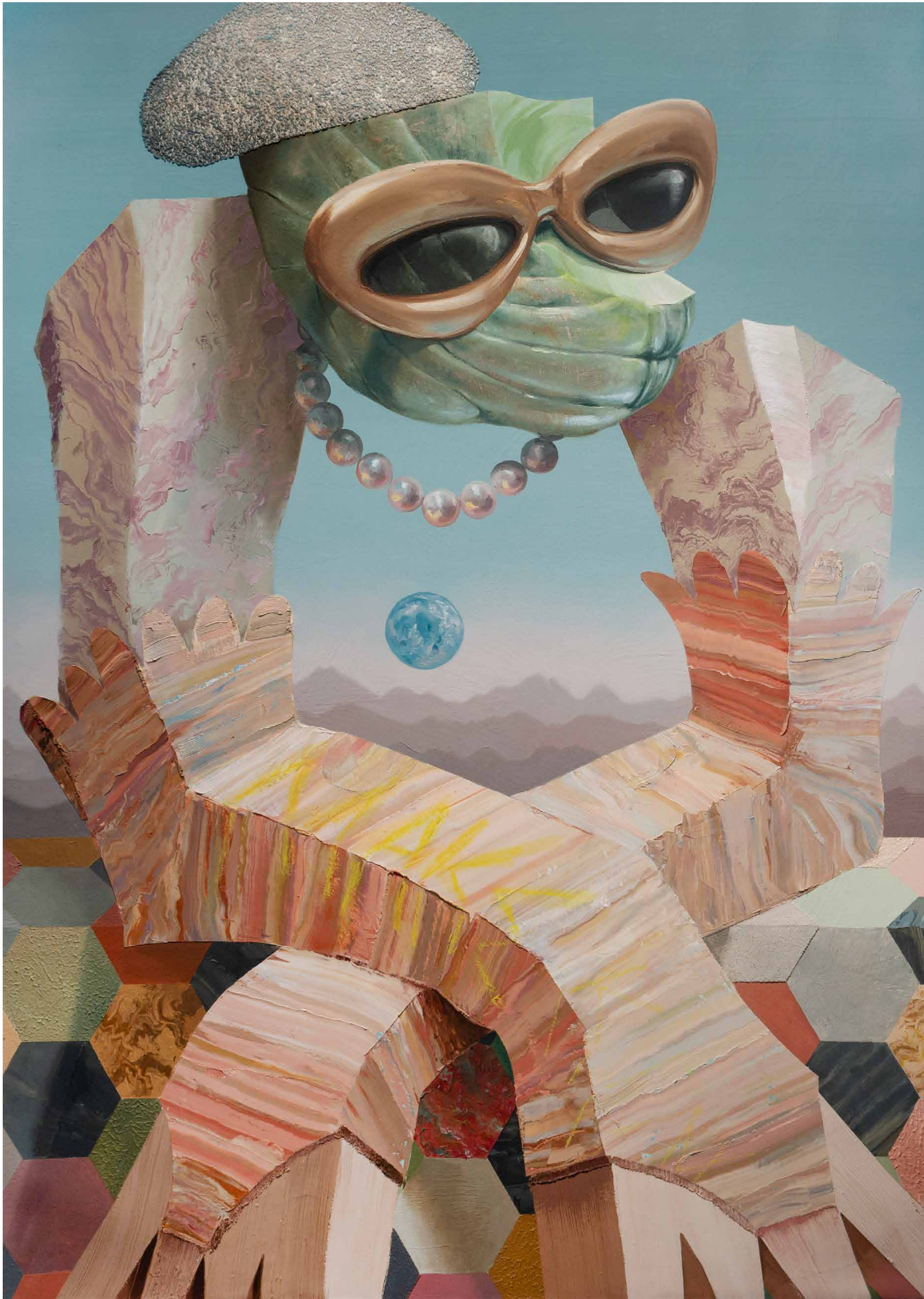
Pachamama's Beat, 2023 Oil on canvas 55 1/8 x 39 3/8 in 140 x 100 cm