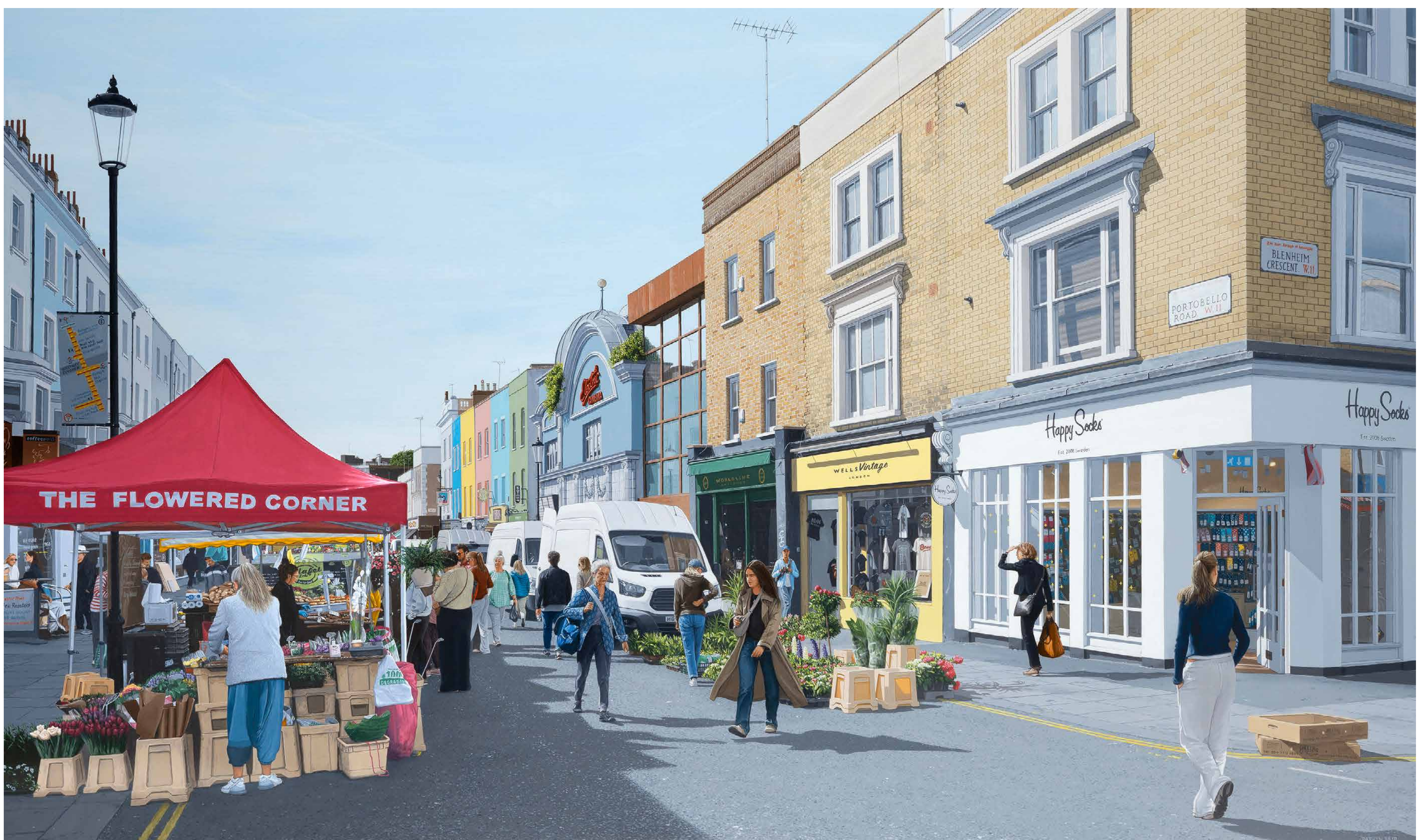
Notting Hill, 2023 Acrylic on panel 25 5/8 x 43 1/4 in 65 x 110 cm