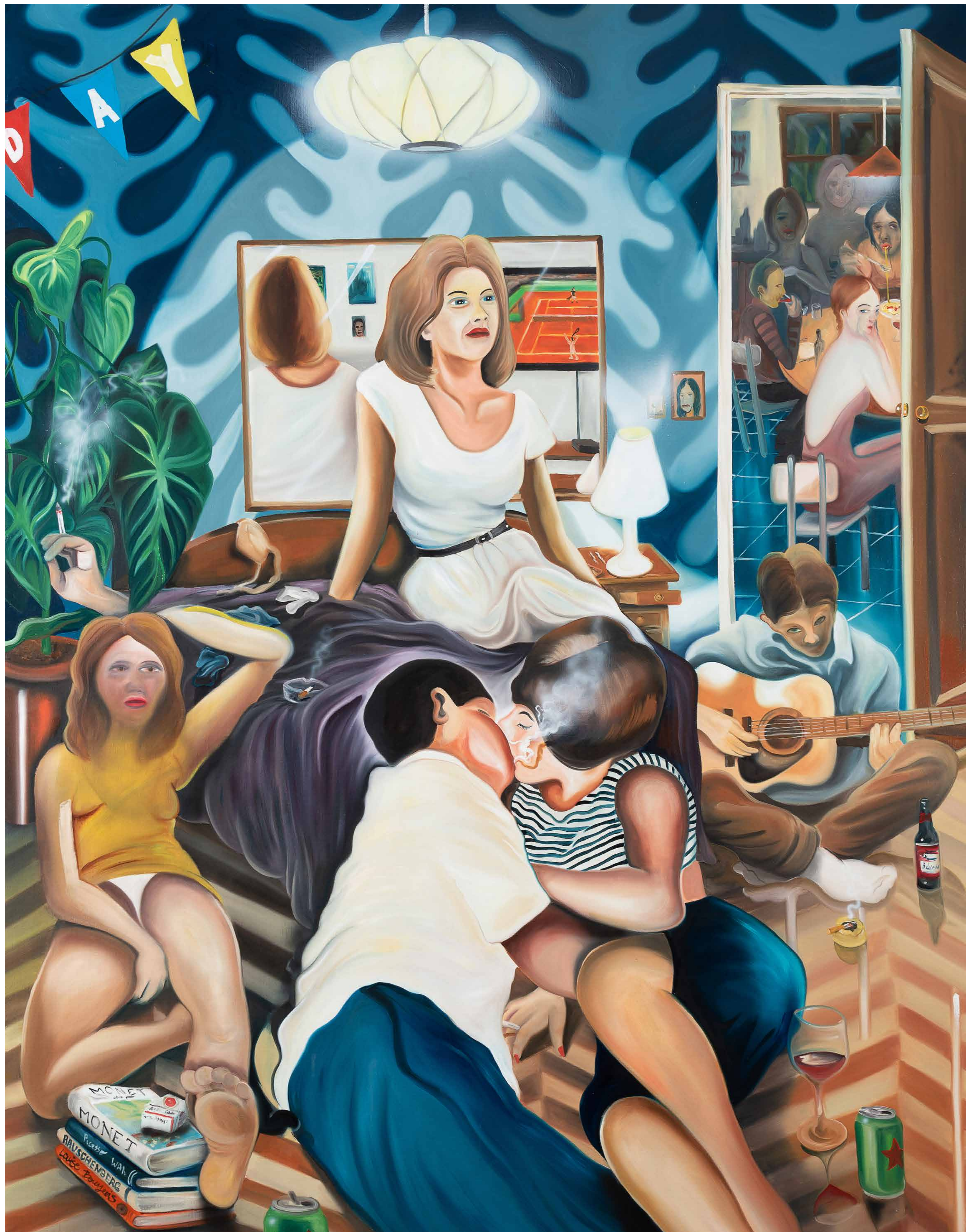
Game Set and Match, 2023 Oil and airbrush on linen 180 x 140 x 3.5 cm 70 7/8 x 55 1/8 x 1 3/8 in