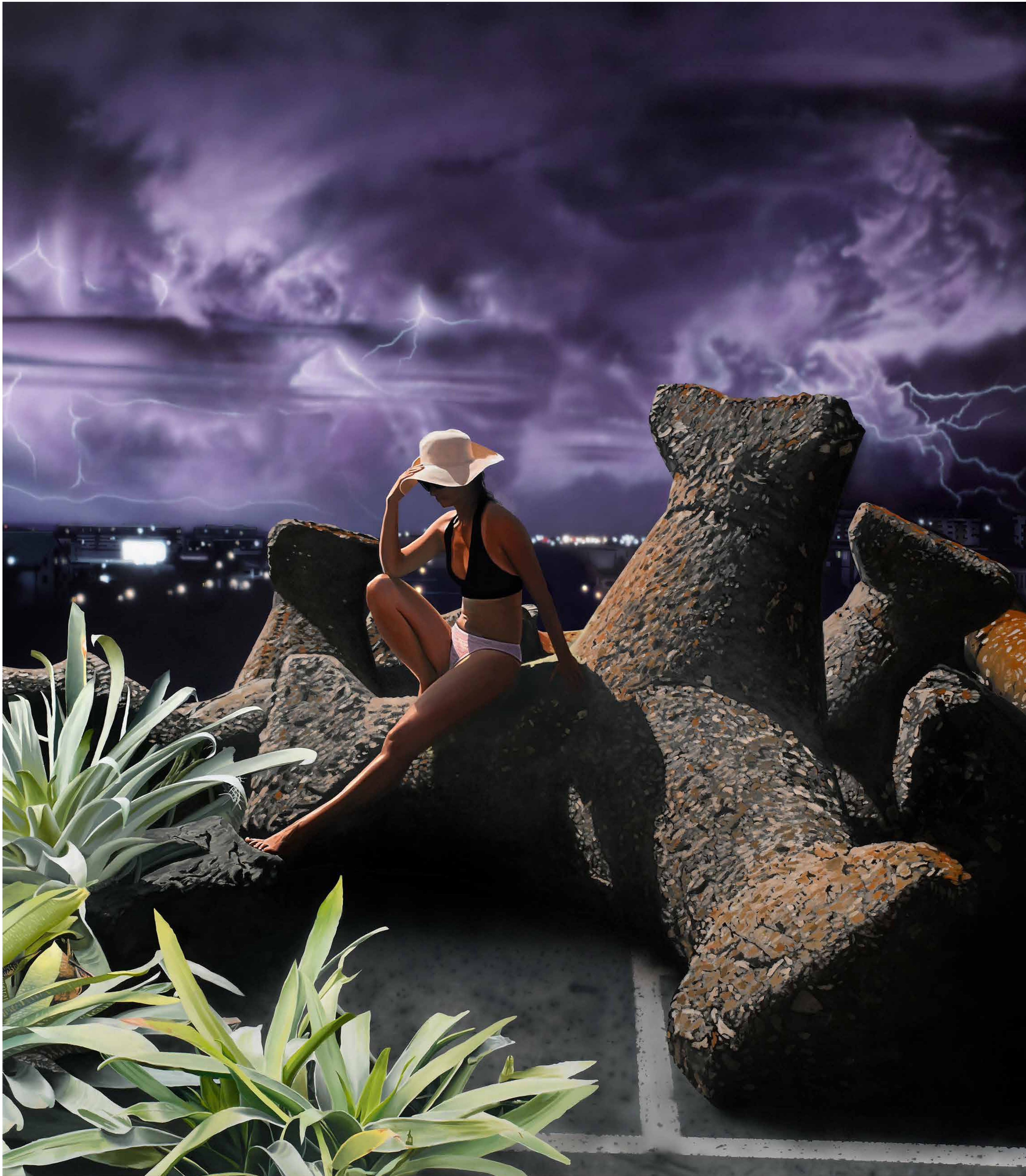
Unpredictable Horizon, 2022 Acrylic and oil on linen 65 x 57 1/8 in 165 x 145 cm