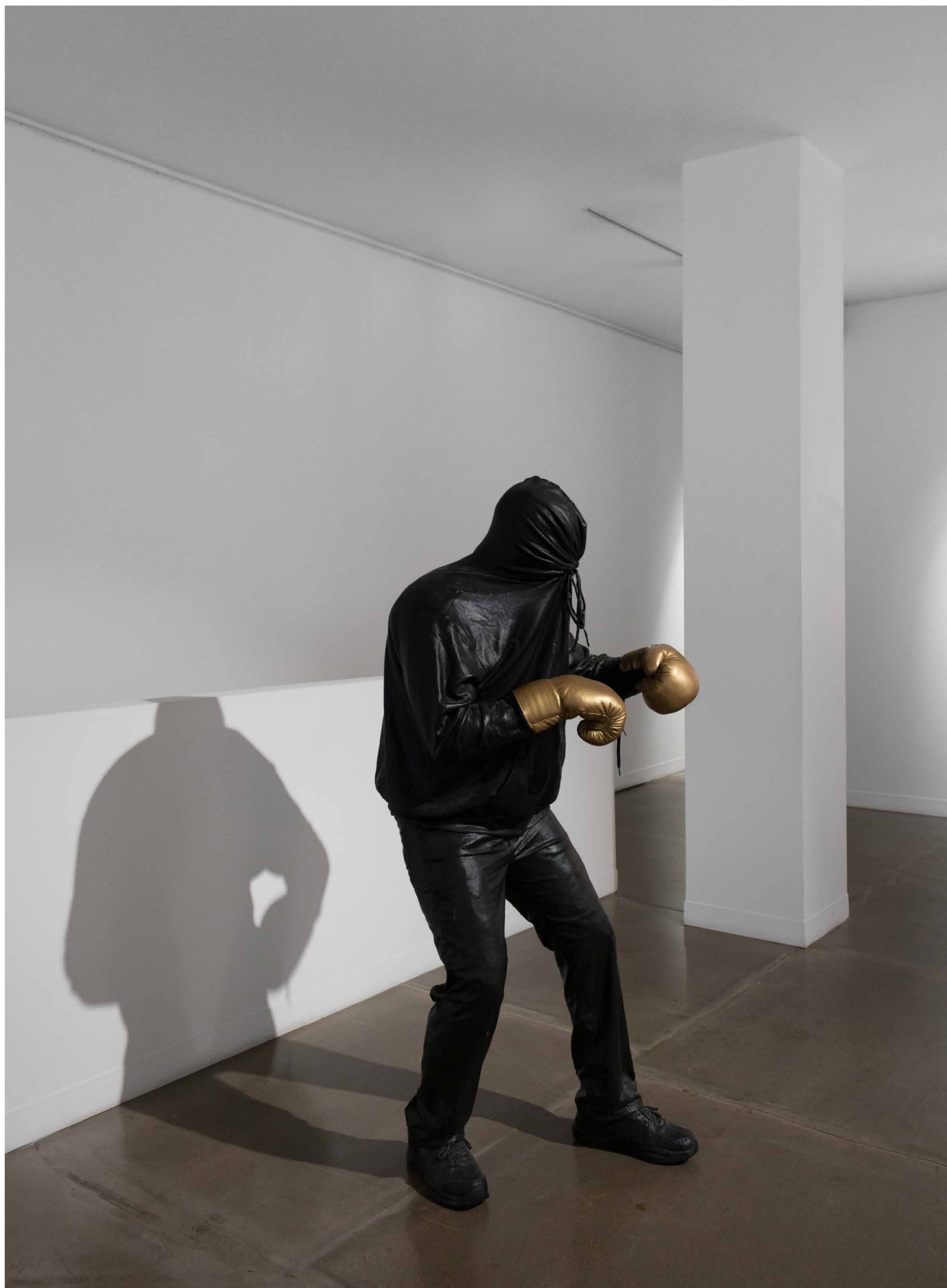
The Fighter , 2017 Mixed media 68 7/8 x 30 3/4 x 31 1/2 in 175 x 78 x 80 cm