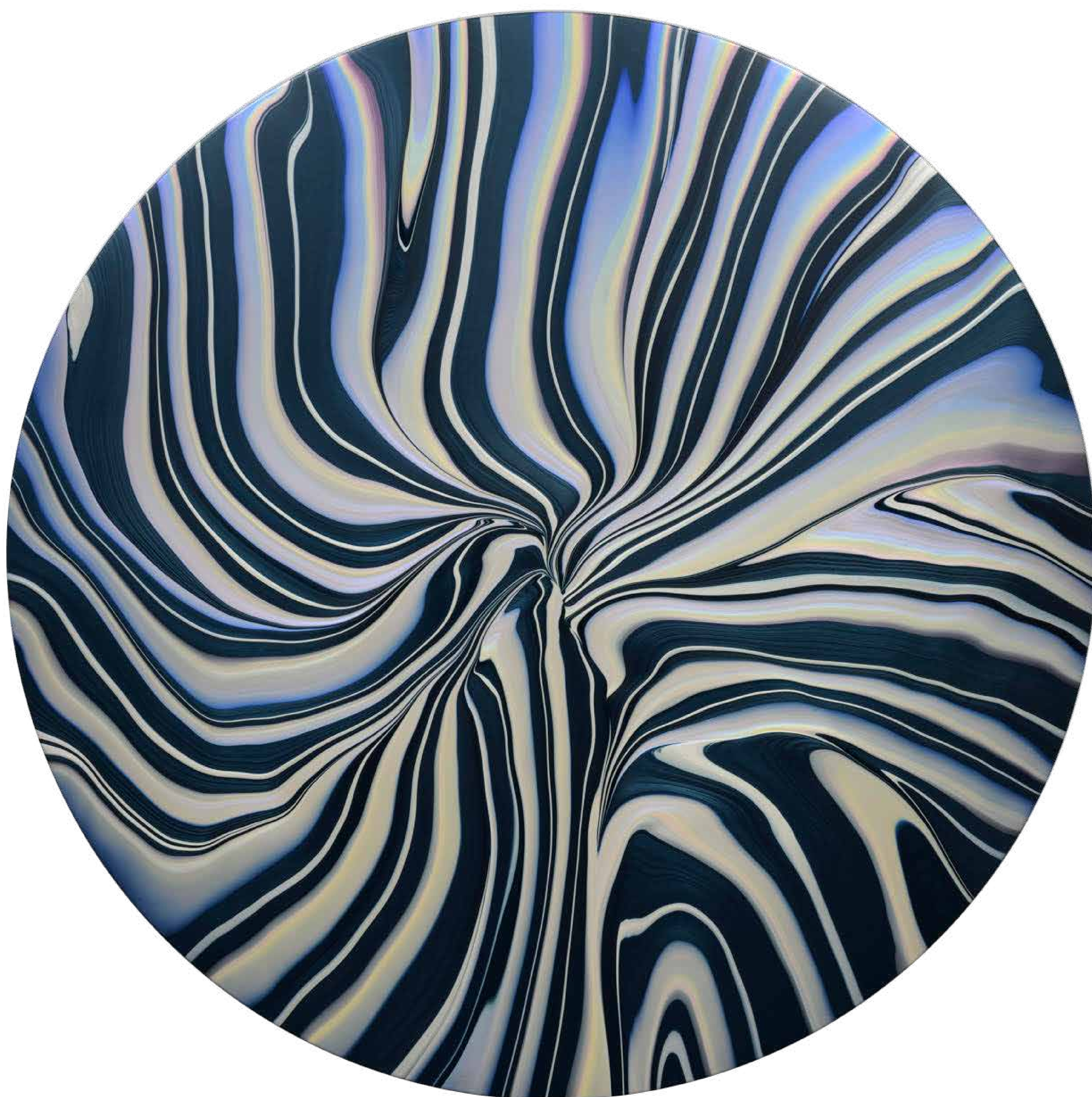
Geodesy 1229, 2022 Acrylic on canvas over circular wood panel 60 x 60 in (60 in diameter) 152.4 x 152.4 cm (152.4 cm diameter)