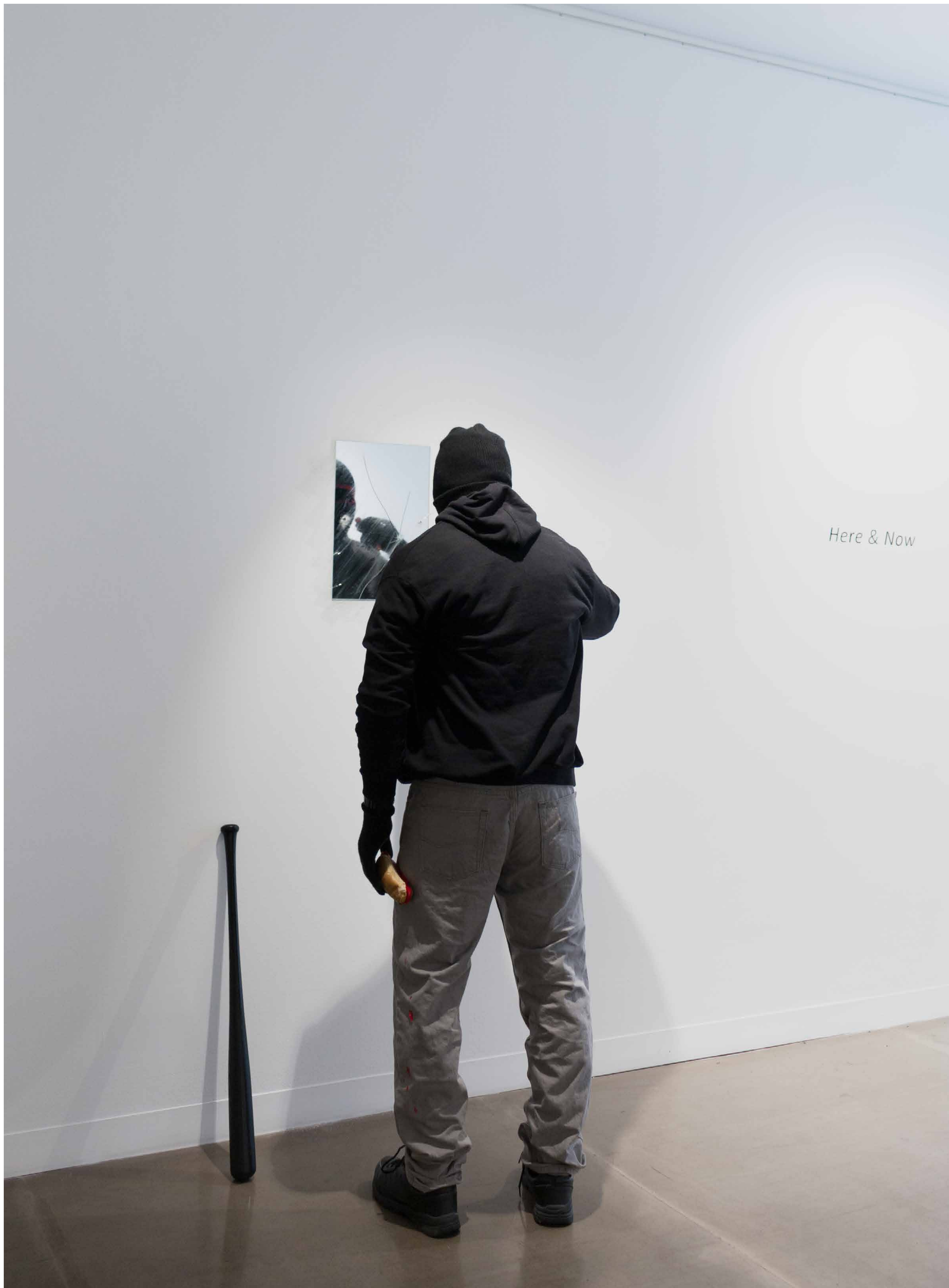
Hot Dog Lipstick , 2021 Mixed media 74 x 33 1/8 x 20 7/8 in 188 x 84 x 53 cm