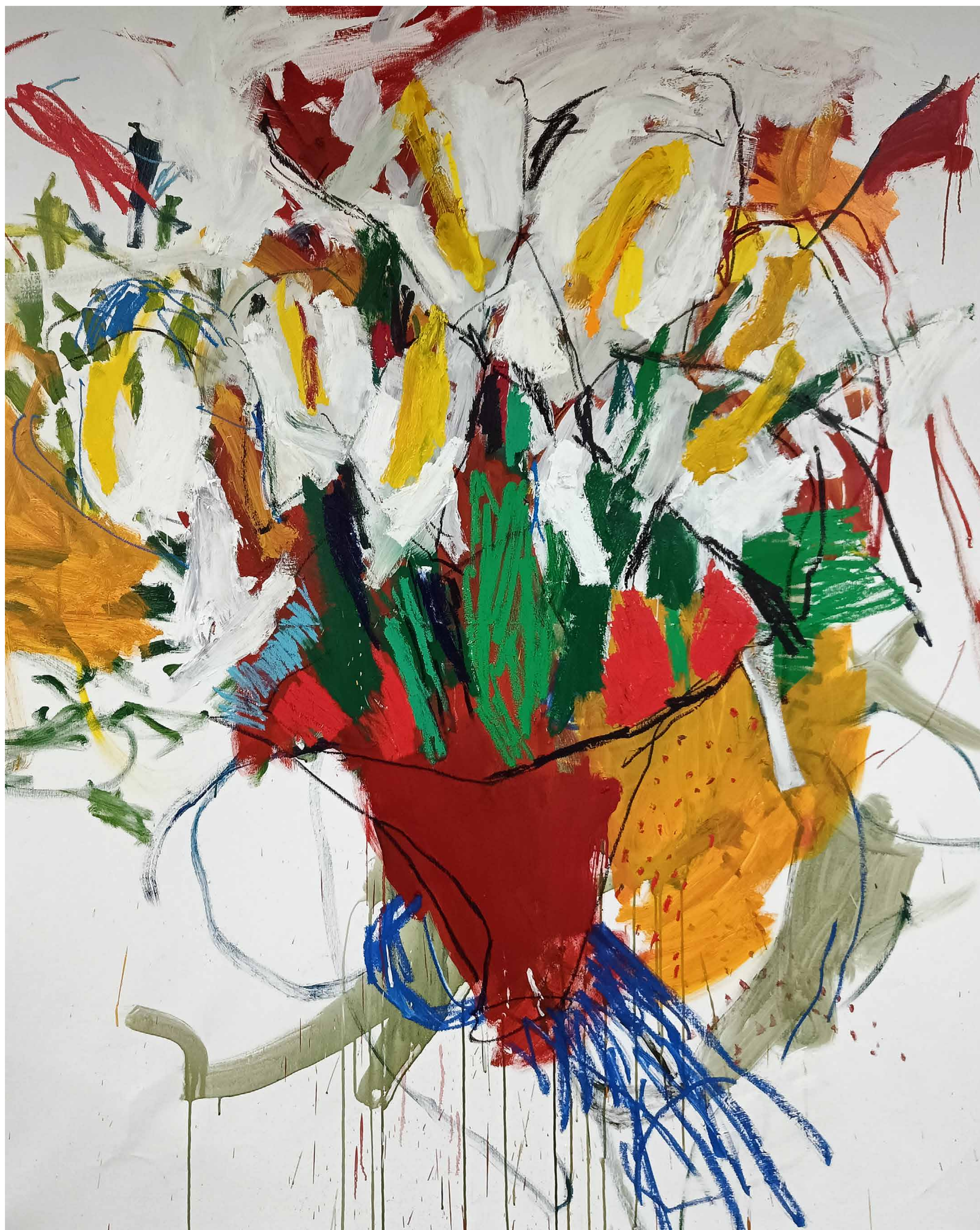
Composition for a basquet with Diego Rivera's bouquet of Callas, 2023 Oil, acrylic, oil bar and oil pastel on canvas 78 3/4 x 63 in 200 x 160 cm