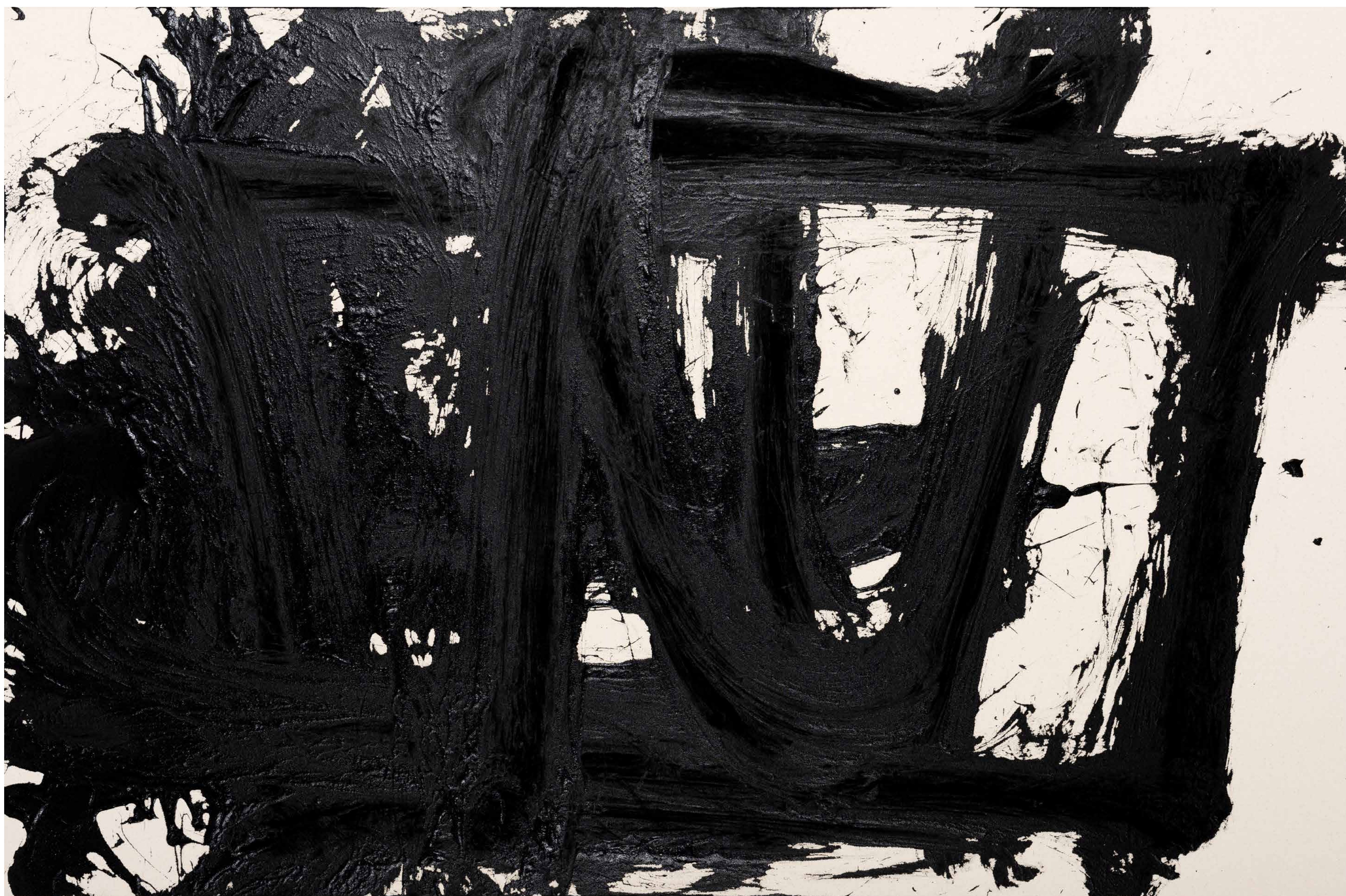
Untitled, 2024 Acrylic on canvas 41 7/8 x 64 1/8 in 106.5 x 163 cm Framed: 43 1/2 x 65 3/4 in 110.5 x 167 cm