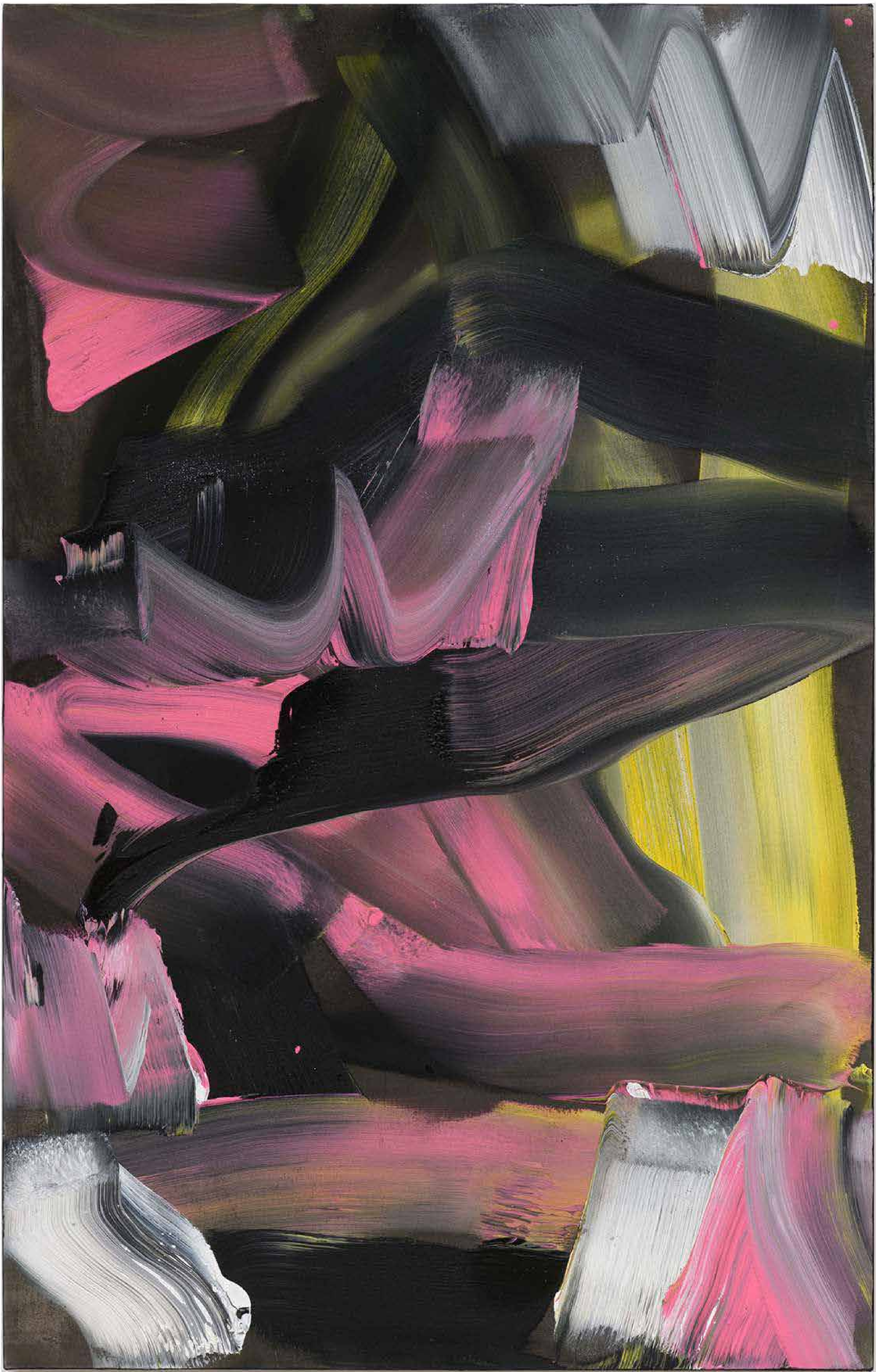
Ha Who , 2016 Acrylic on canvas 167.6 x 106.7 cm 66 x 42 in