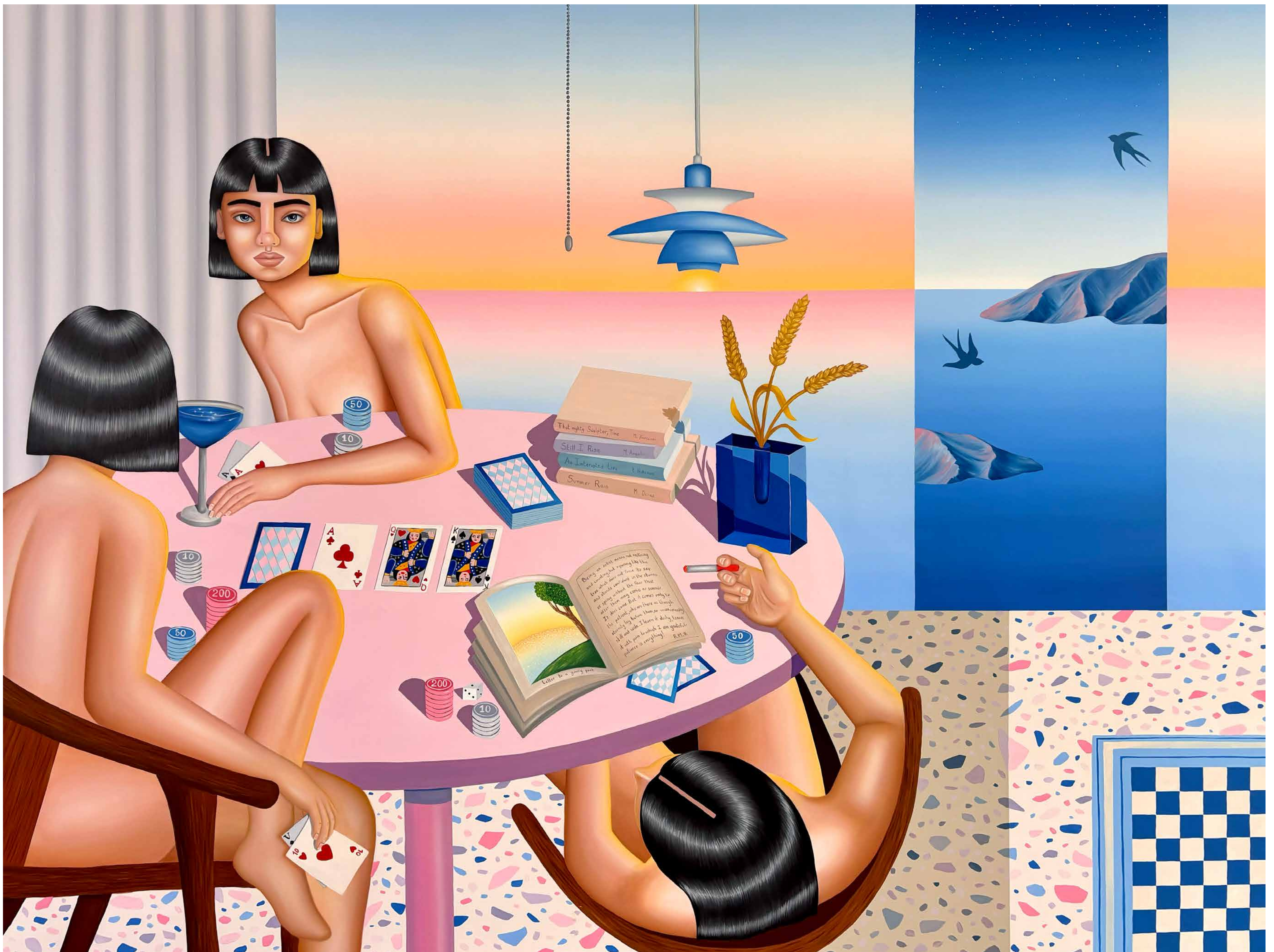
« Time is the seas' expanse Time, it is all in one And in its womb - The sun abundance », 2024 Oil on canvas 47 1/4 x 63 in 120 x 160 cm