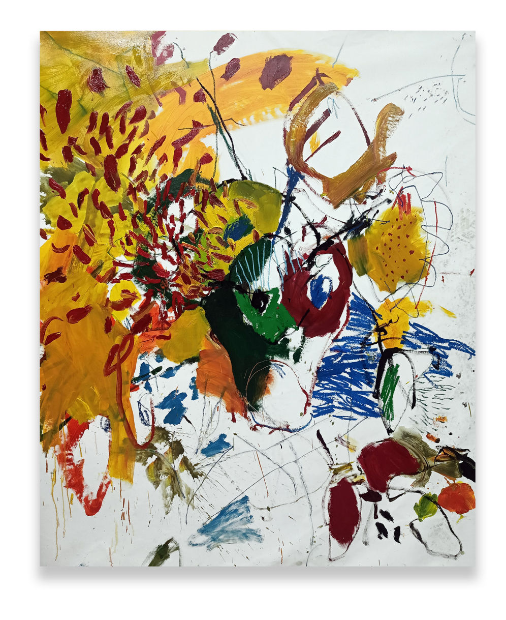
Composition for sunflowers and jug, 2023