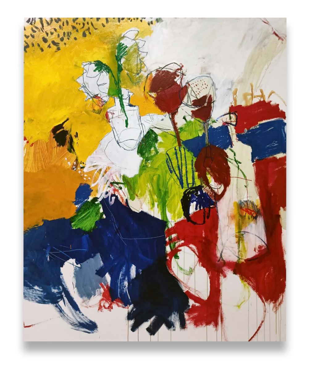
Composition for a Saturday's lunch, 2023