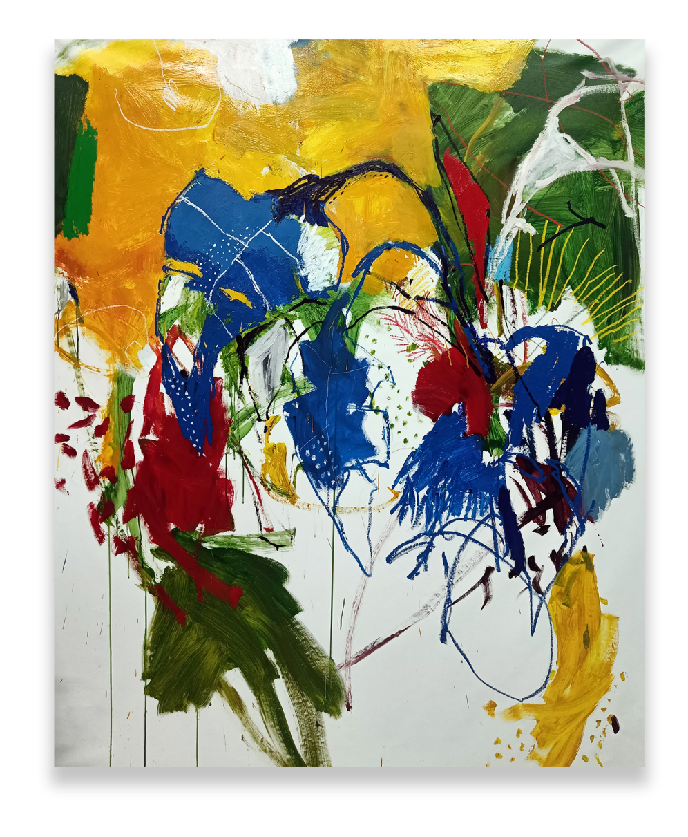
Composition for a blue banana tree, 2023