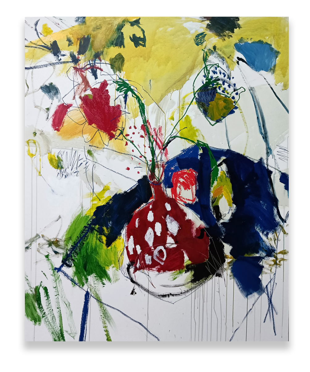
Composition for three frowers and a pot, 2023